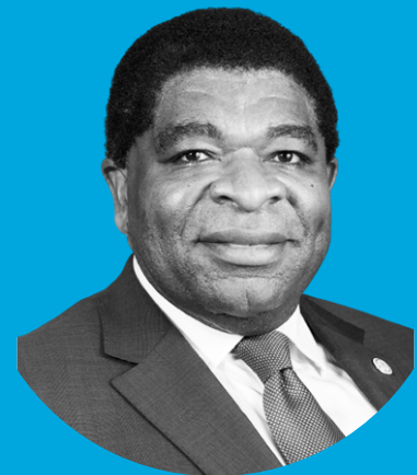
Martin Chungong Secretary General of Inter-Parliamentary Union

“ Redressing young women's under-representation in political life calls for political will and commitment, strong policy measures and multi-stakeholder partnerships. We should not let 2020 be the year of a global pandemic only but make it the year of substantial progress towards full implementation of the Beijing Declaration and Platform for Action with and for young women. ”