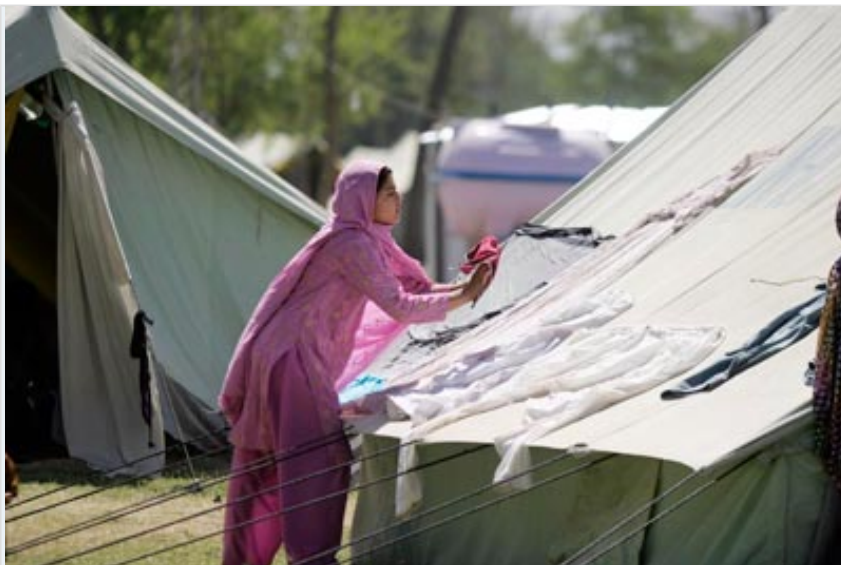
Girl and tent

Environmental degradation, climate change, natural disasters and armed conflicts threaten the liveability of towns and cities. Since 1975, there has been a four-fold increase in the number of recorded natural disasters, including tsunamis, tropical cyclones, earthquakes and flooding. 11 Seven out of ten natural disasters are believed to be climate-related. 12 To improve policies and programmes, governments and urban planners benefit from understanding how gender affects women and men differently as victims of disasters, but also how the knowledge and skills of both can help them and their communities to survive.