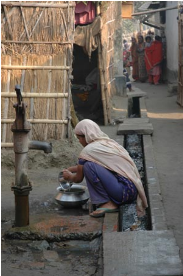
Woman washing utensils by standpipe

their homes and less than one third have adequate sanitation. 7