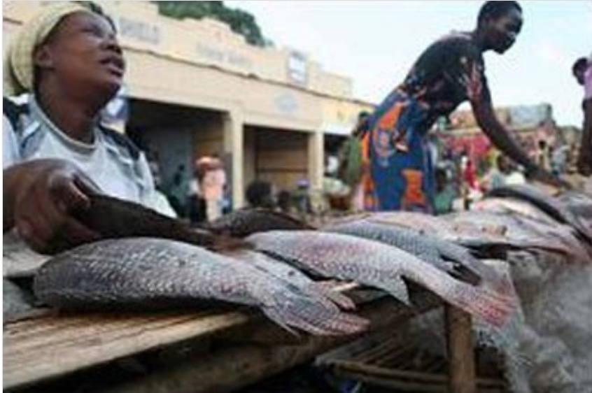
Female fish vendor

“reducing rural poverty by sending money back to their home villages.” 24