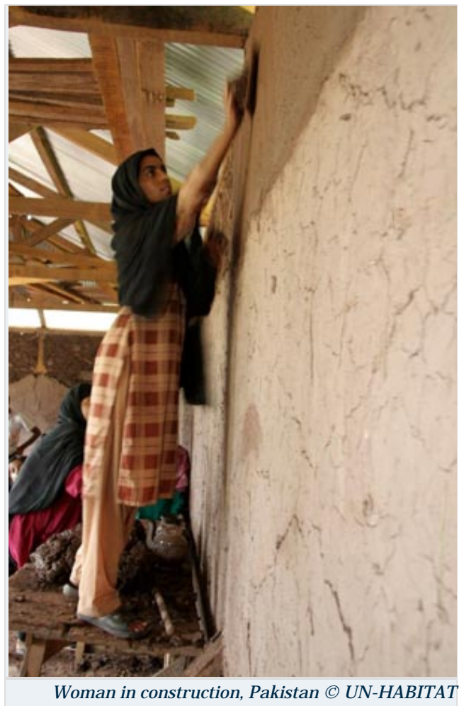
Woman in construction, Pakistan