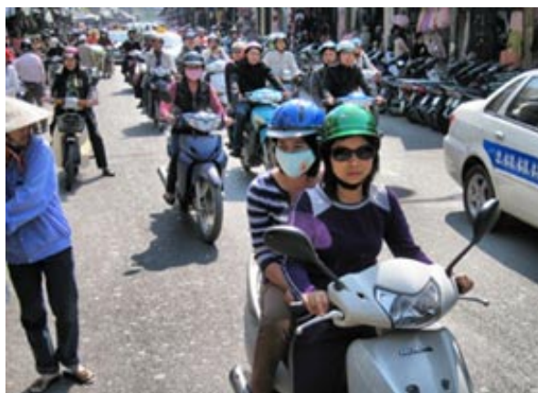
Vietnamese women on motorcycles

Slum dwellers make up close to 828 million people or 33 percent of the world's urban population. 4 They experience varying deprivations and risks, which can include a lack of durable housing, overcrowding, insufficient access to clean water, poor sanitation, and threats of forced evictions. Women and girls often suffer the worst effects.