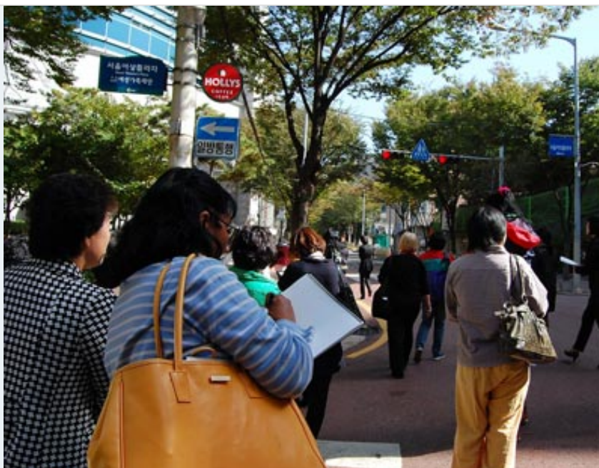
Women in Seoul take part in a safety audit of nearby streets and public spaces.

In conflict, disaster and post-crisis situations, risks to women and girl's safety are even greater. In these contexts, rape and gender-based violence against women are common and often used as systematic methods of terrorising and subjugating civilians. Sexual exploitation in camps for displaced people is also widely reported, and some studies have shown that domestic violence also tends to rise in post-crisis situations.