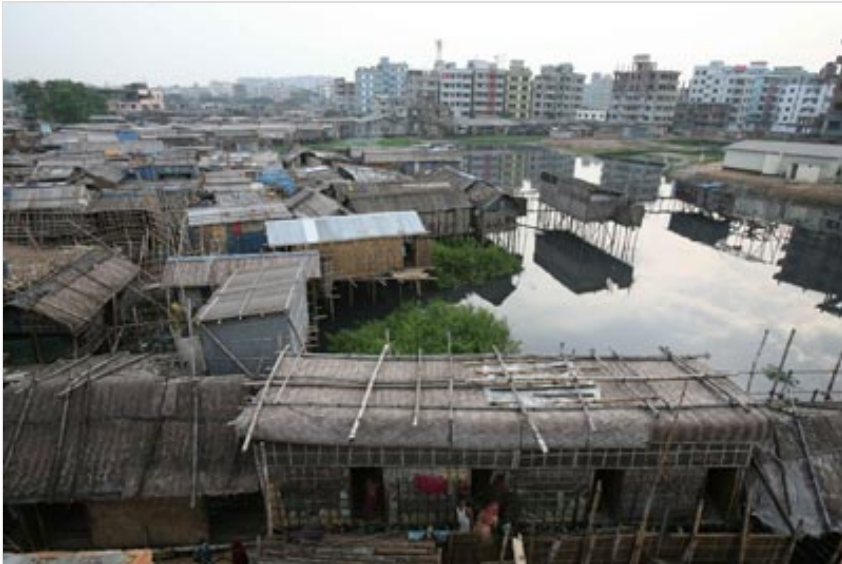
Slum and highrise contrast

According to the World Bank's economic research, poverty incidence tends to be lower in countries with more gender equality, while economic growth "also appears to be positively correlated with gender equality." 18 Although it is too simplistic to conclude that economic benefits are directly caused by gender equality, or vice versa, the research suggests the two go hand-in-hand.