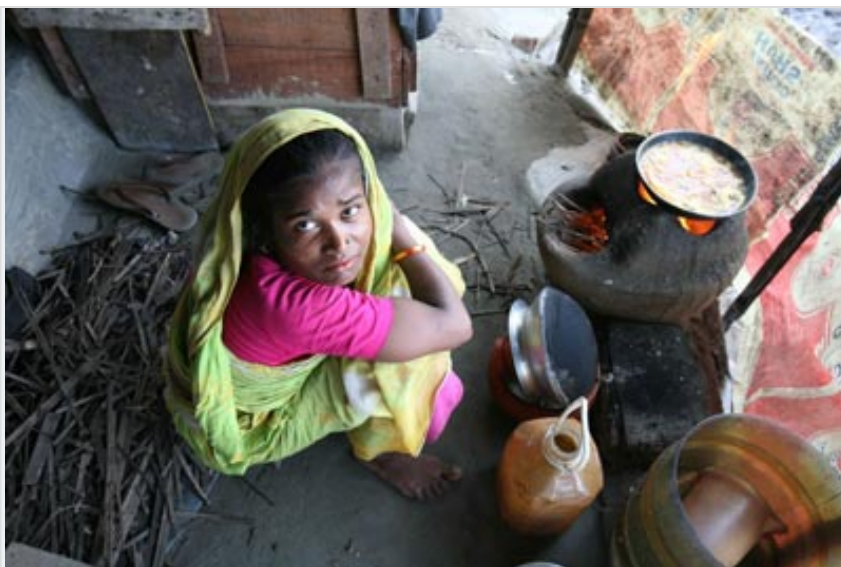
Woman cooking over fire

The United Nations Economic and Social Commission for Asia and the Pacific (UNESCAP) states in its 2007 annual survey that the region is losing $40-42 billion a year due to restriction on women's access to employment and another $16-30 billion a year because of gender gaps in education. 20