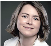
Catarina de Albuquerque

United Nations Special Rapporteur of the Human Rights Council on the Human Right to Safe Drinking Water and Sanitation