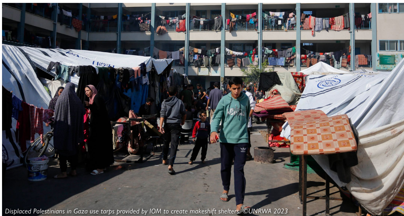
Displaced Palestinians in Gaza use tarps provided by IOM to create makeshift shelters.