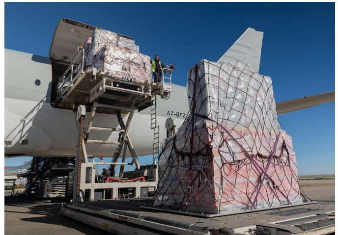
Pallets of essential aid items are received at a Jordanian airport for delivery to Gaza.