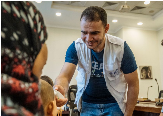
An IOM health team ensures that a family is fit for travel from Egypt home to their country of origin.

Additionally, IOM trained 110 frontline healthcare workers and paramedics at the Egyptian Ambulance Organization (EAO) on International Trauma Life Support and Basic Life Support to support patients from Gaza in Egypt. IOM also provided medication, supplies, equipment and 108 Emergency Backpack kits to EAO's frontline operations. IOM will continue to support the Ministry of Health and ERC to better facilitate smooth operations for evacuees and patients.