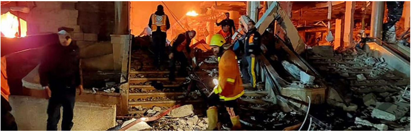
Increased airstrikes in Rafah have heightened concerns of an escalation in the most southerly city in Gaza, where hundreds of thousands of Palestinians have sought refuge. Buildings on fire in Rafah following an overnight attack. Photo by the Civil Defence, 12 February 2024.