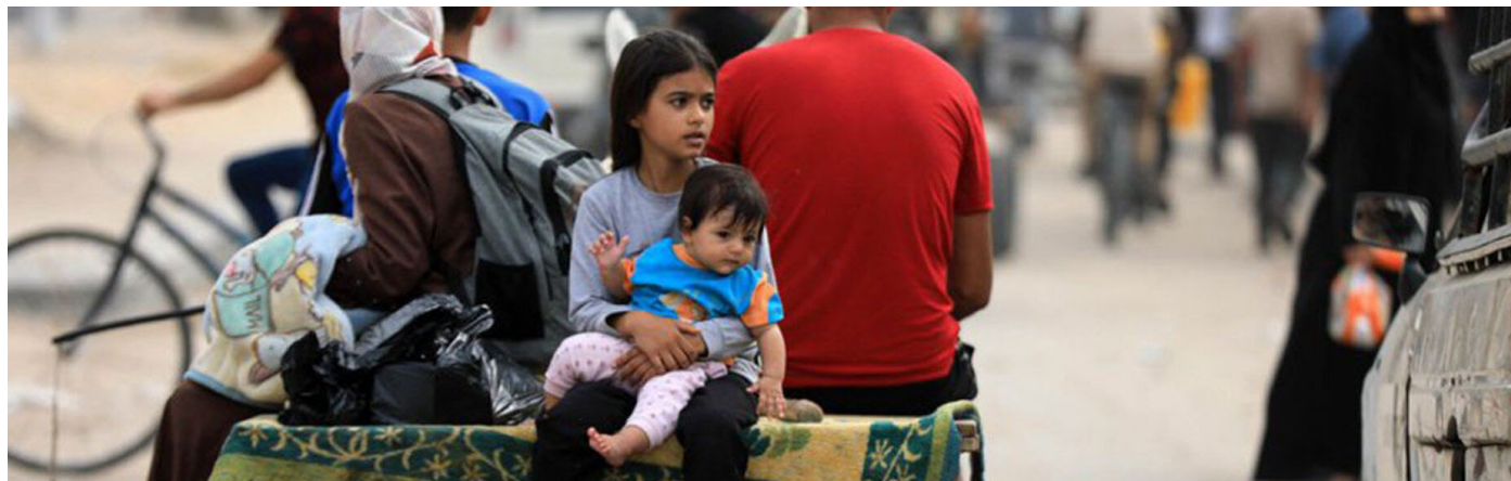
Palestinians fleeing Khan Younis on donkey carts in search of safety in the southern town of Rafah.