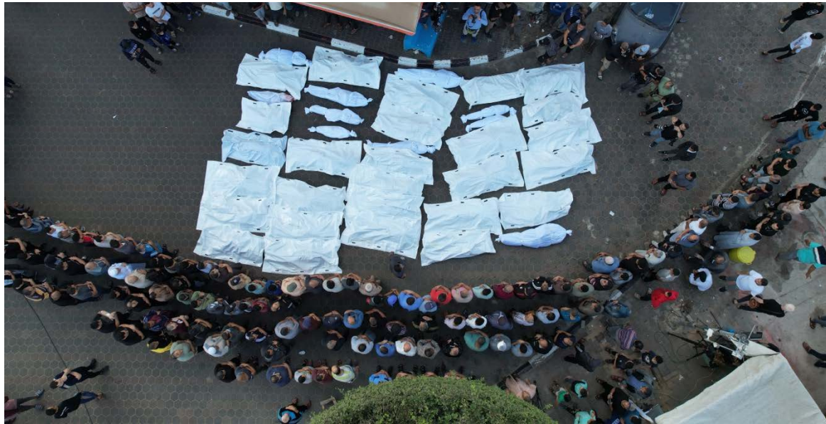
The outside of the morgue of Al Aqsa Martyrs' Hospital, Gaza on 6 November 2023.