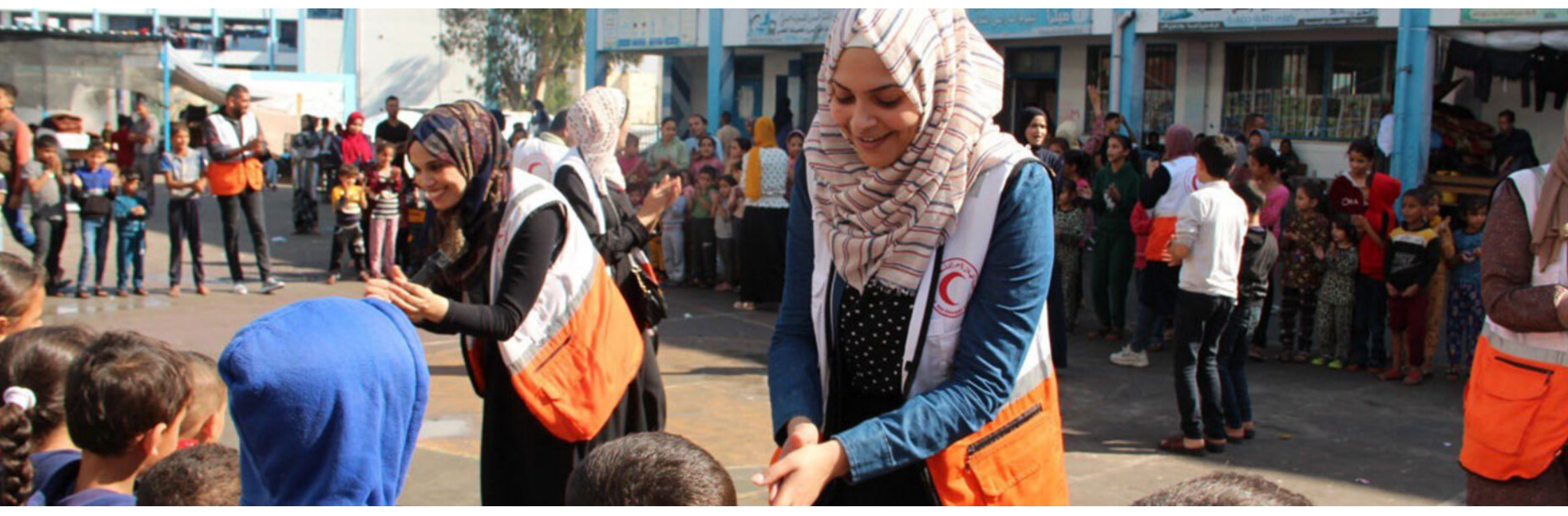
Volunteers providing psycho-social support to children in southern Gaza through recreational activities in a school being used as a shelter for displaced people.