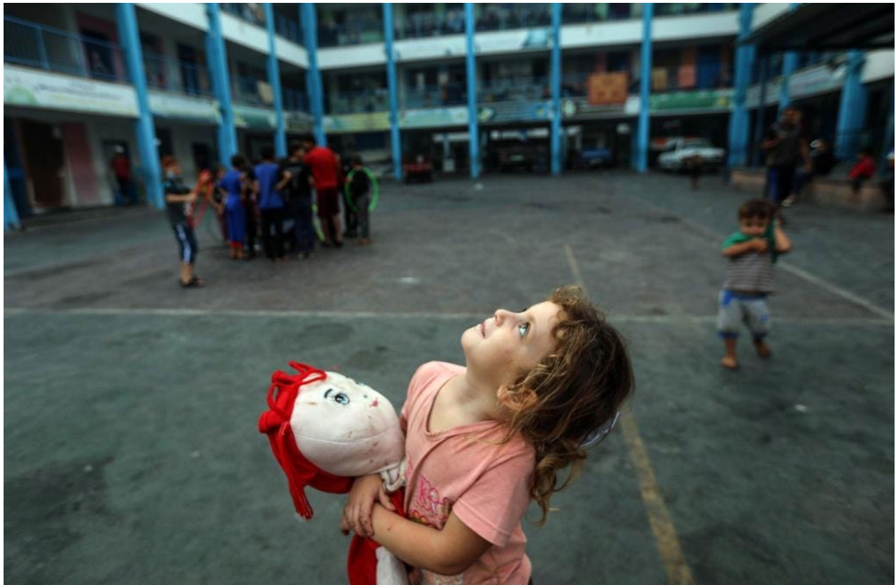
A picture of children seeking shelter at Al-Shati Elementary Joint Refugee School in Al-Nasr, Gaza. 8 October 2023

Further, efforts will be made to ensure that the response outlined is fully complementary with humanitarian-development-peace nexus initiatives.