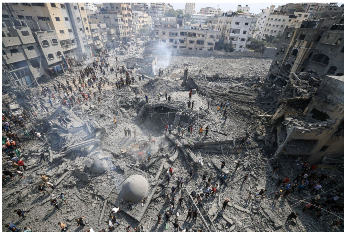
Palestinians inspect the damage following an Israeli airstrike on the Sousi mosque in Gaza City on October 9, 2023.