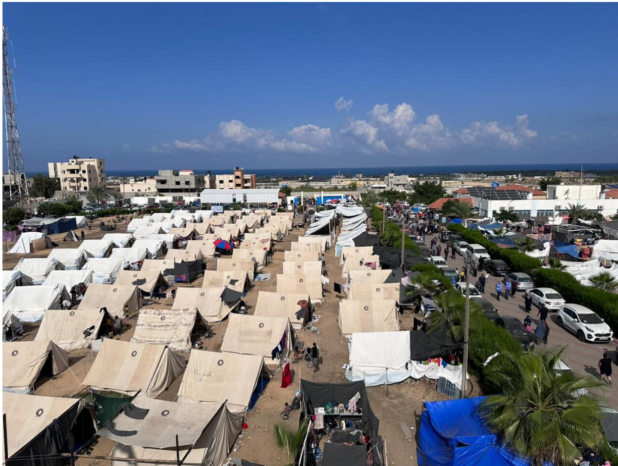
Internally displaced persons staying in tents in the southern Gaza Strip. 19 October 2023