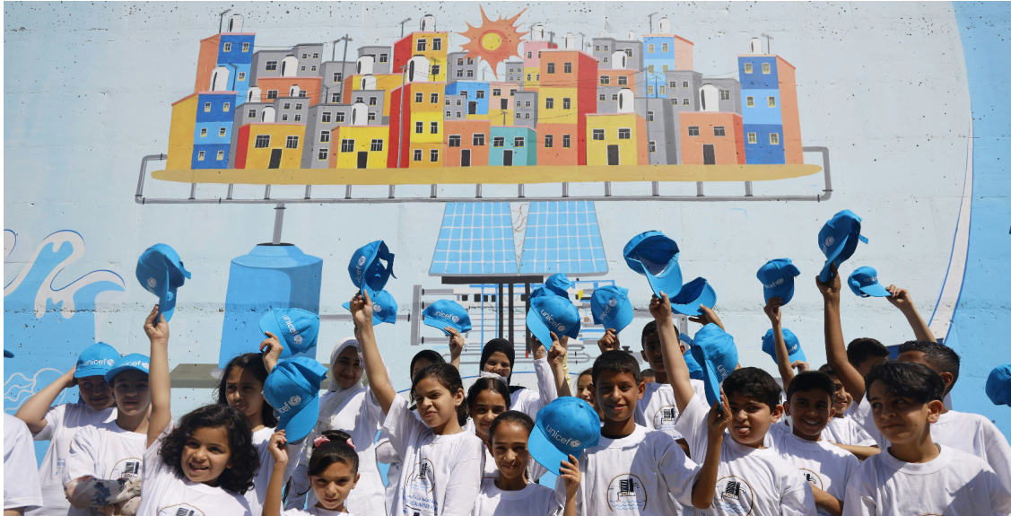
Children posing the camera during the celebration of finalizing the second phase of the UNICEF-Desalination Plant expansion in the Gaza Strip.