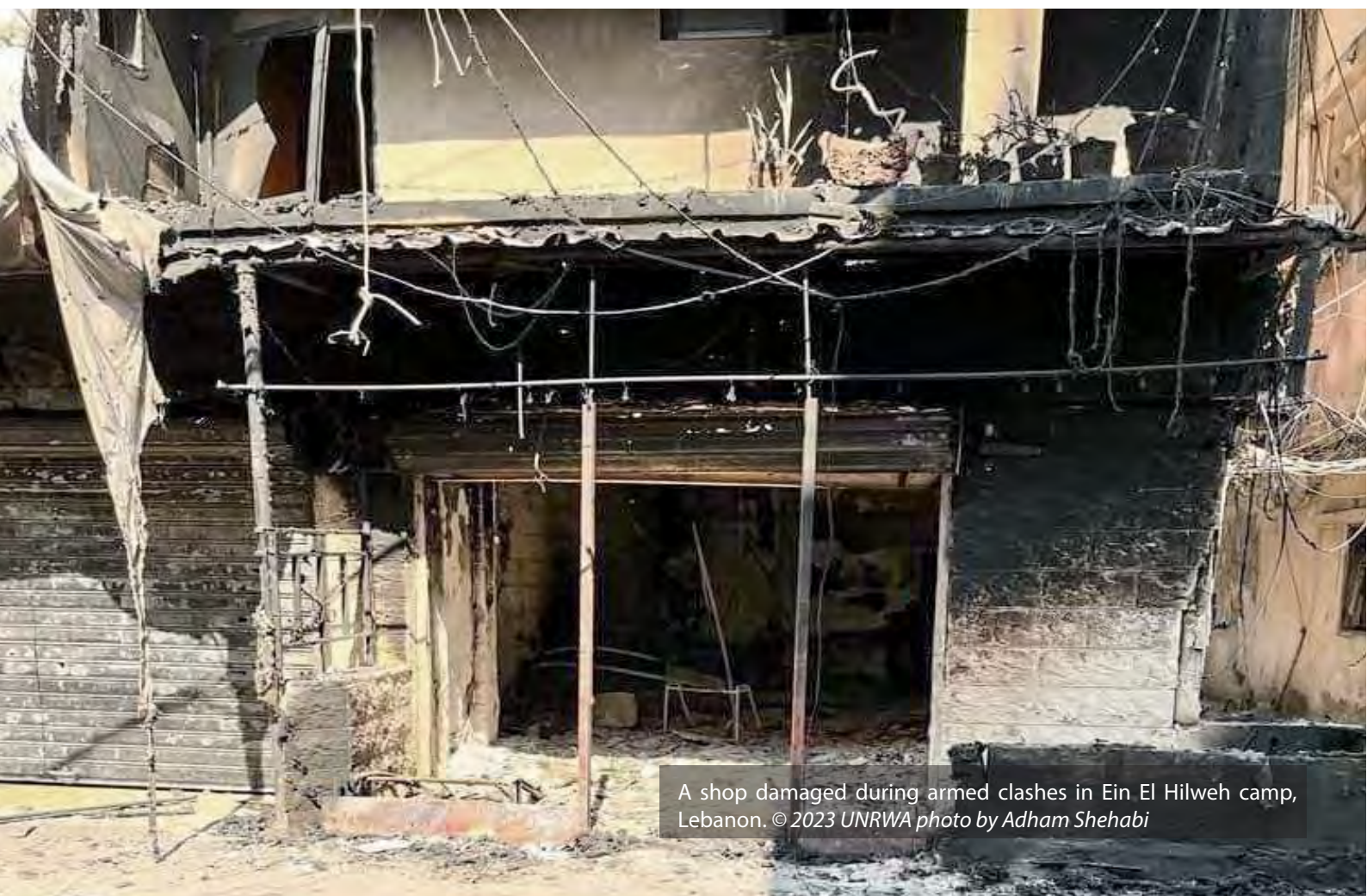
A shop damaged during armed clashes in Ein El Hilweh camp, Lebanon.