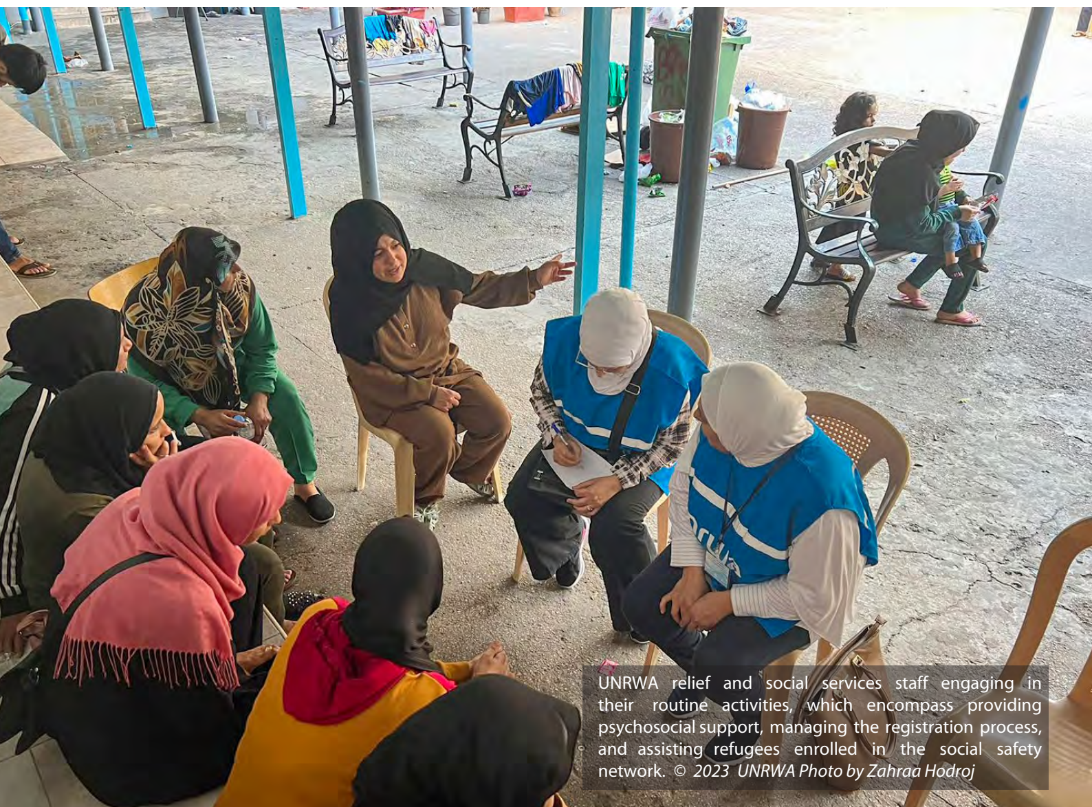
UNRWA relief and social services staff engaging in their routine activities, which encompass providing psychosocial support, managing the registration process, and assisting refugees enrolled in the social safety network.

Recognising the complexity of the environment in which UNRWA staff operate, tailored staff care will be offered, in addition to UNRWA's regular psycho-social staff support, with the aim of supporting a healthy and productive workforce as well as sustaining wellbeing amongst staff.