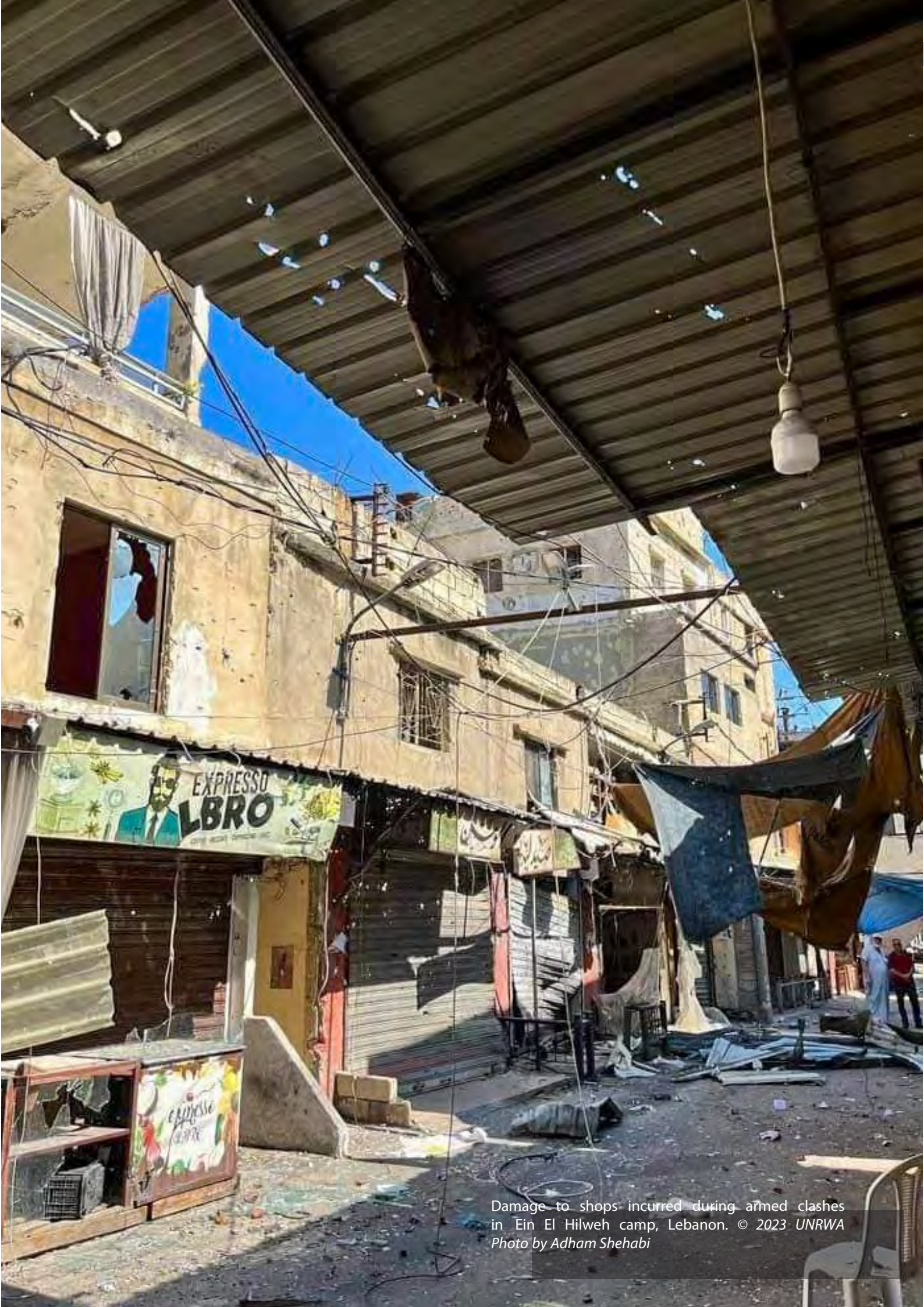
Damage to shops incurred during armed clashes in Ein El Hilweh camp, Lebanon.