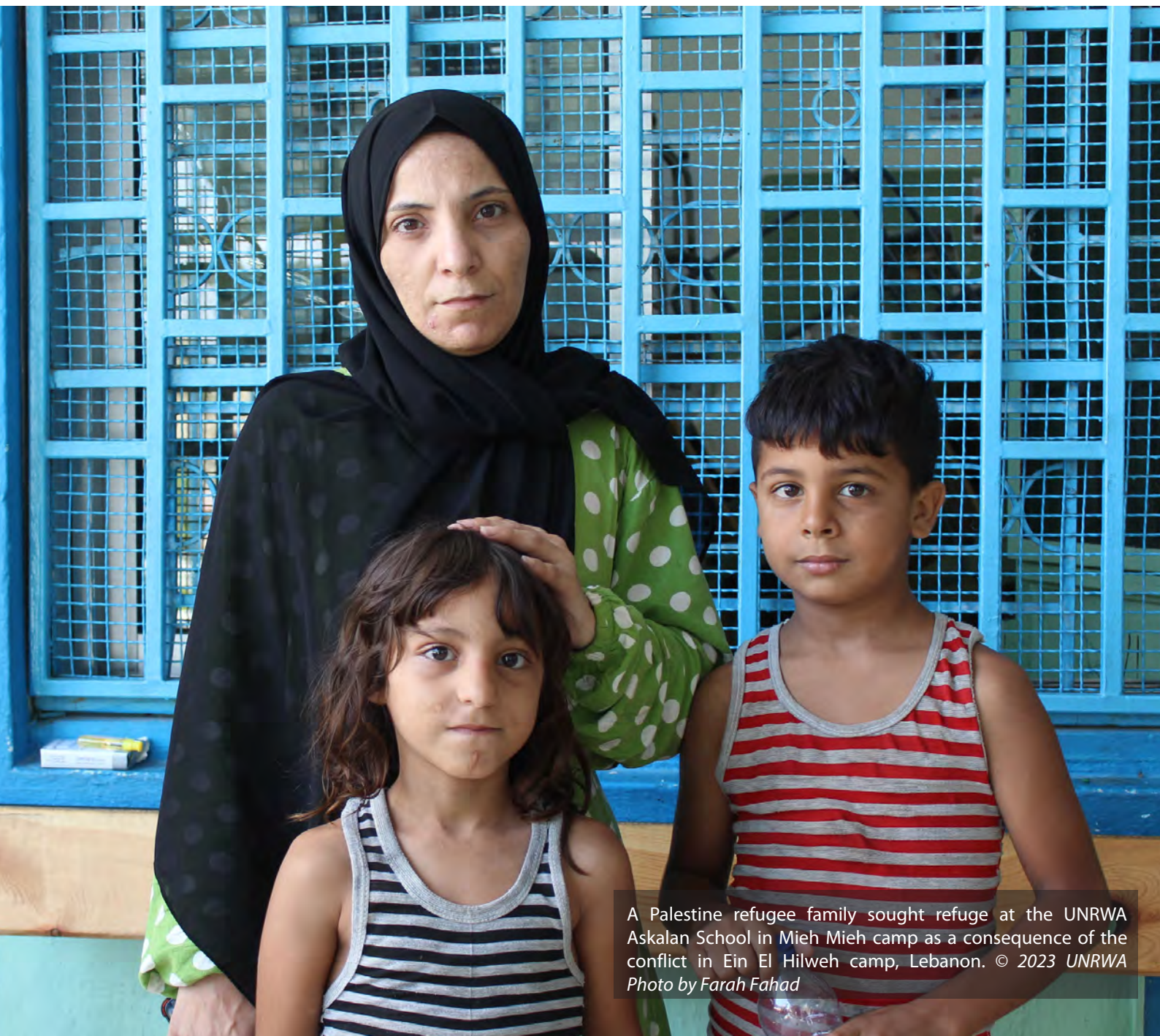
A Palestine refugee family sought refuge at the UNRWA Askalan School in Mieħ Mieħ camp as a consequence of the conflict in Ein El Hilweh camp, Lebanon.