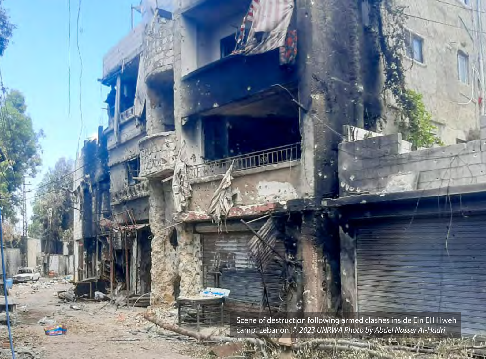
Scene of destruction following armed clashes inside Ein El Hilweh camp, Lebanon.