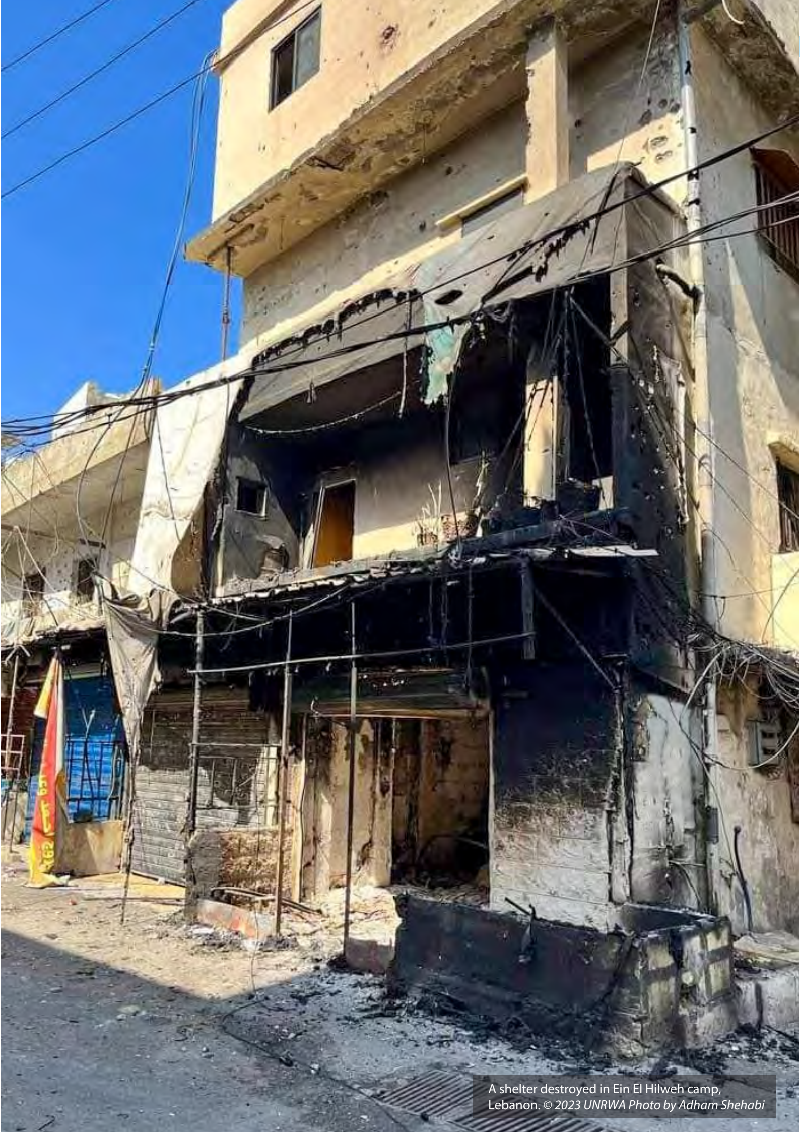
A shelter destroyed in Ein El Hilweh camp, Lebanon.