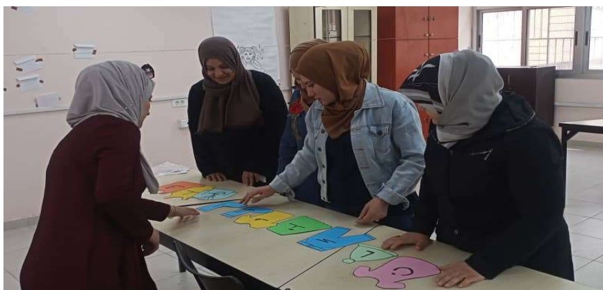
Caregivers of 9 th grade students participating in sessions to help them support their children during exams