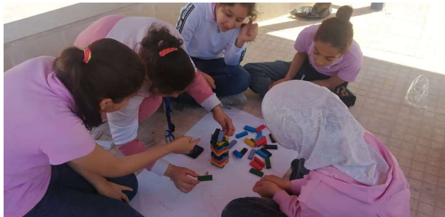
Recreational activities for children in Central Area