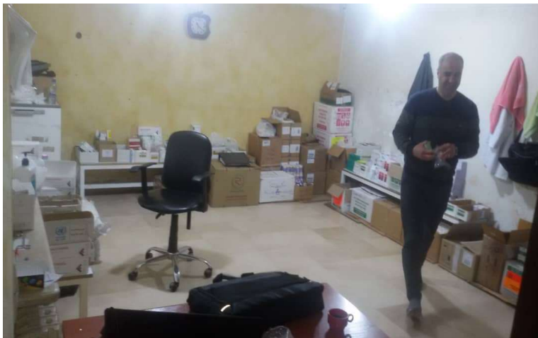
Temporary pharmacy in Aleppo, following the destruction of UNRWA Health Centre