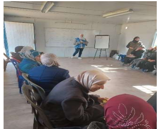
Psychological first aid session for mothers in Ein el-Tal Camp