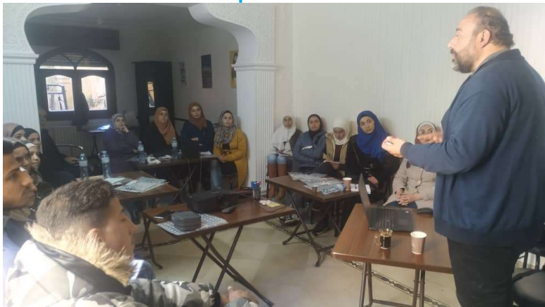
Psychological first aid training to UNRWA staff in Aleppo