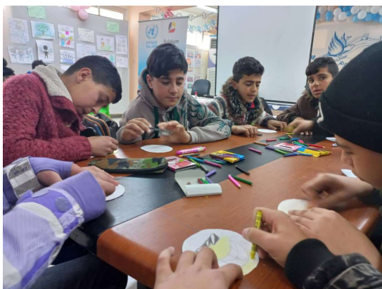
Psychosocial support and activities in Acre school, Aleppo