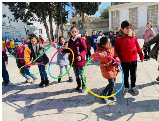
Psychosocial support activities in Jineen School, Aleppo