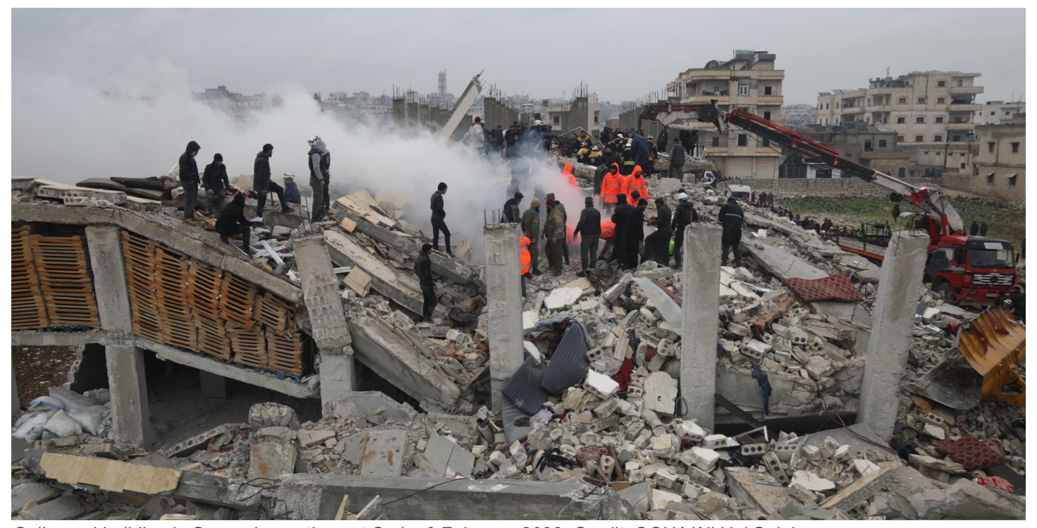
Collapsed building in Sarmada, north-west Syria. 6 February 2023.