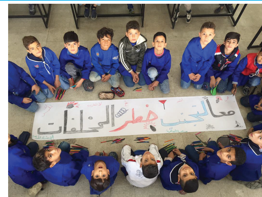
ERW awareness-raising sessions in UNRWA schools to protect them and make change in their behaviour.