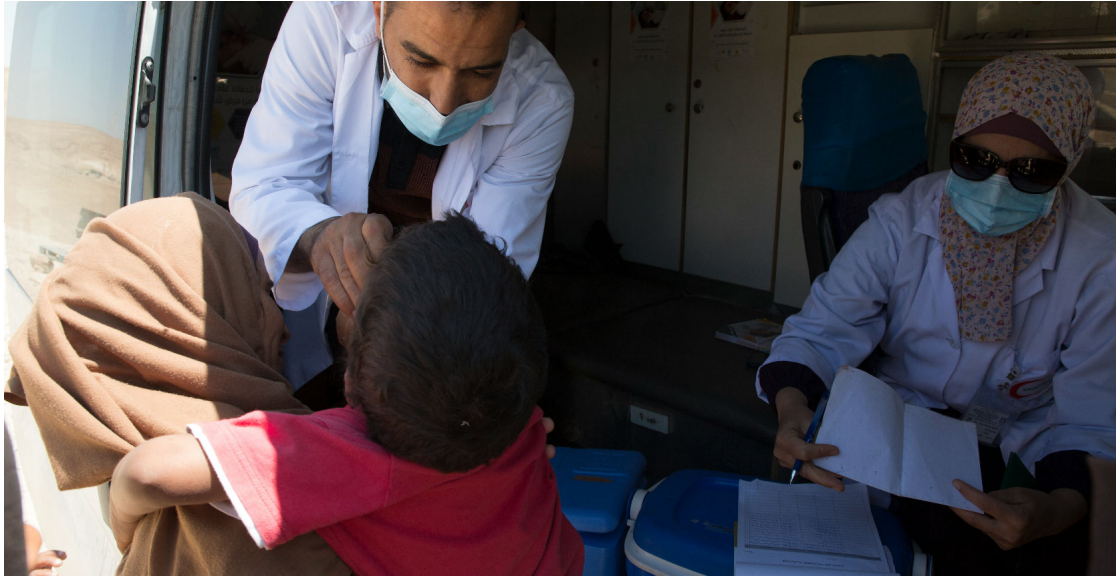
A child getting Polio vaccine in a marginalized area in Bethlehem City. The polio campaign was implemented by the Palestinian Ministry of Health in partnership with UNICEF, WHO, and UNRWA.