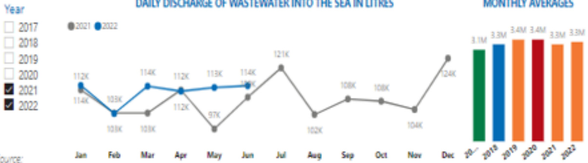
DAILY DISCHARGE OF WASTEWATER INTO THE SEA IN LITRES MONTHLY AVERAGES

* BOD stands for Biological Oxygen Demand. It is indicative of how effective wastewater treatment is.