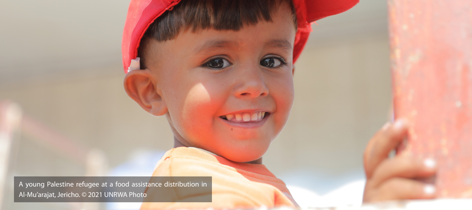
A young Palestine refugee at a food assistance distribution in Al-Mu'arajat, Jericho.