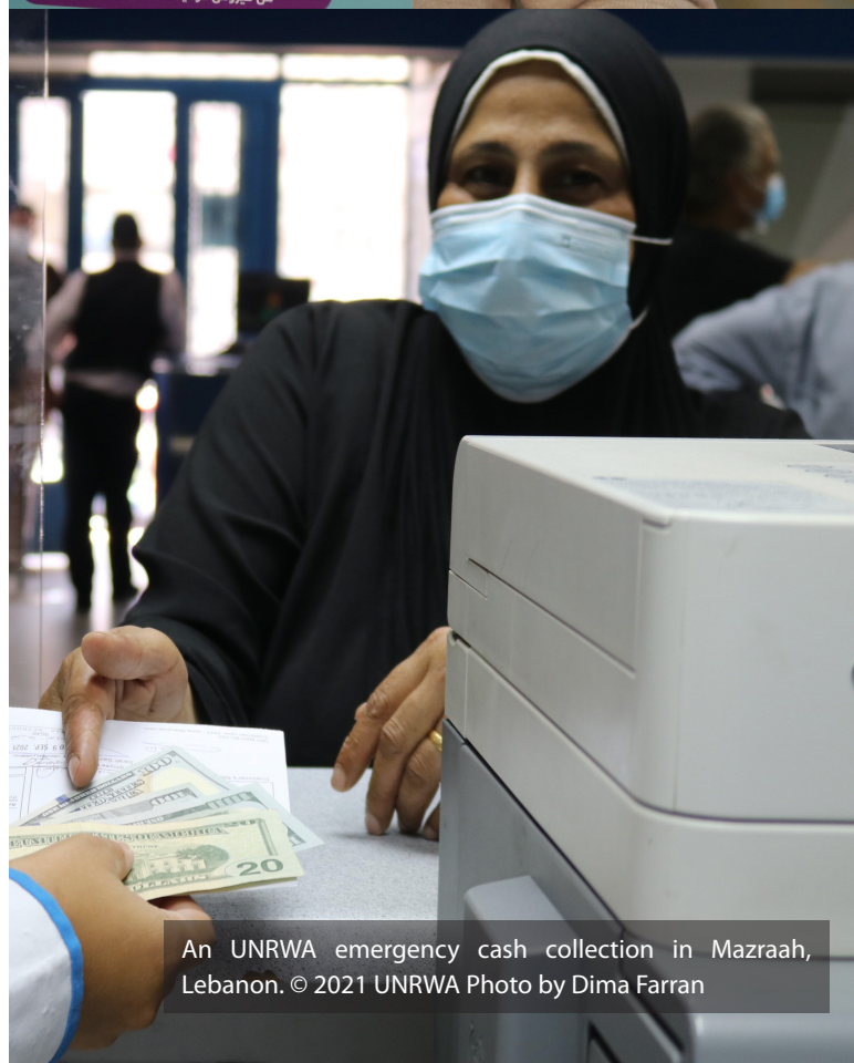
An UNRWA emergency cash collection in Mazraah, Lebanon.