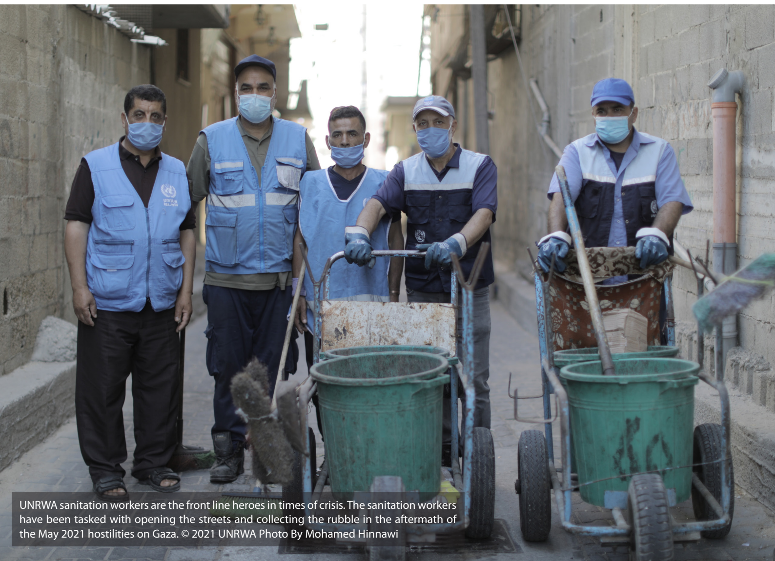
UNRWA sanitation workers are the front line heroes in times of crisis. The sanitation workers have been tasked with opening the streets and collecting the rubble in the aftermath of the May 2021 hostilities on Gaza.

Additional funds are needed for priority projects supporting programmatic reforms of UNRWA core services as well as Agency's construction efforts, particularly those resulting from conflict leading to ongoing displacement, and investments in digital technology.