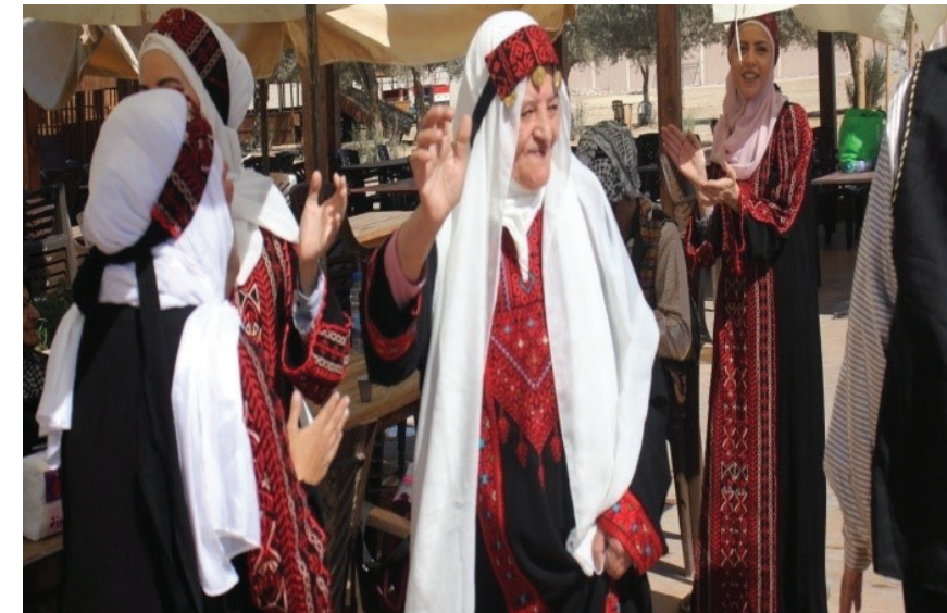
Psychosocial support for the elderly in Damascus.