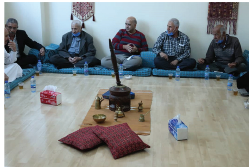
Psychosocial support for the elderly in Qabr Essit camp.

91 PSS counselors received Non-violent communication training. 60 PSS counselors received (AVAC) Addressing violence against children training.