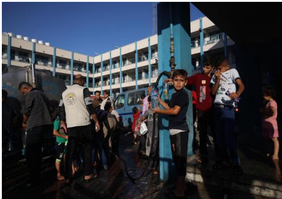
Children gather at a water truck to fill bottles with clean drinking water, 14 May 2021.