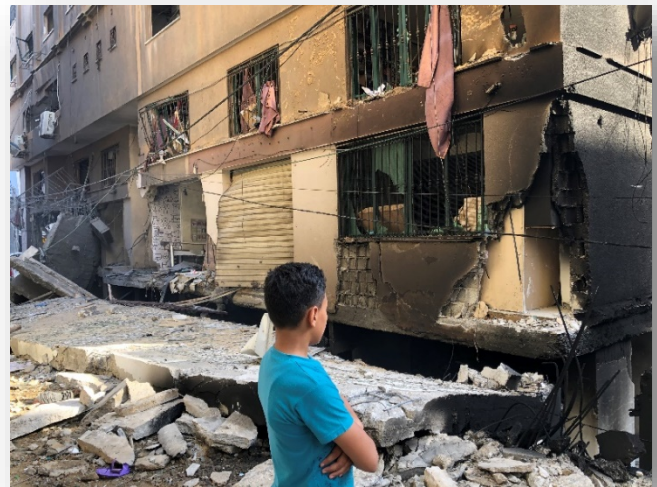
Gaza, 12 May 2021.

According to the Government Media Office in Gaza, extensive damage is reported to civilian properties located in densely populated areas all over Gaza, with over 500 housing units