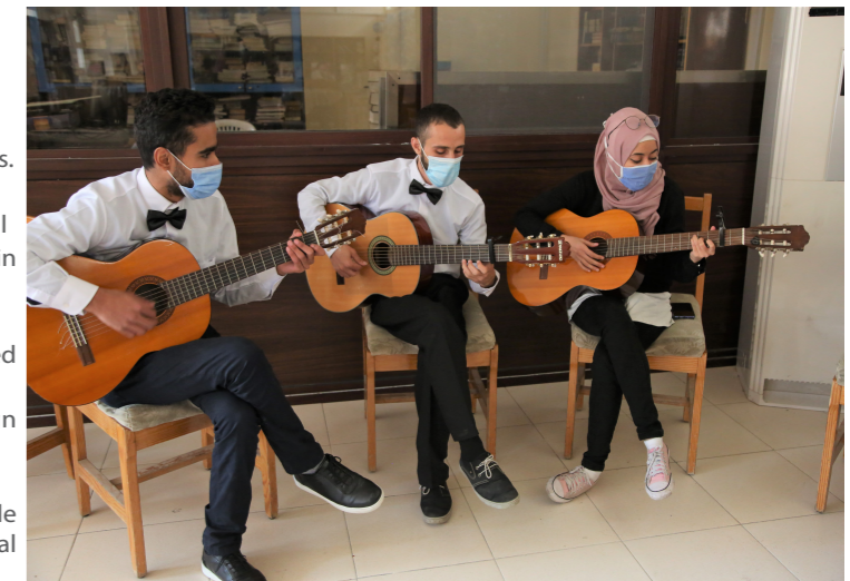
Palestine refugee adolescents sing and perform at the opening ceremony of a photo exhibition of Palestine refugees with disabilities at UNRWA Damascus Training Centre