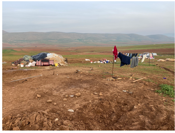
Scattered personal belongings, following further demolitions, Humsa Al Bgai'a, 8 February 2021

humanitarian needs and demolition assessment following the demolitions / confiscation on 1 February. This triggered an initial distribution of emergency shelters. food and essential household items by humanitarian partners, including the Palestine Red Crescent Society (PRCS), as well as the Palestinian Authority. A proportion of this was confiscated and / or damaged by Israeli forces on Wednesday February.