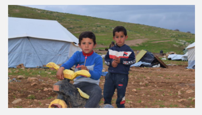
Displaced children in Humsa - Al Buqai'a on 4 February 2021.

For more on the general and legal background, please see Flash Update #1.