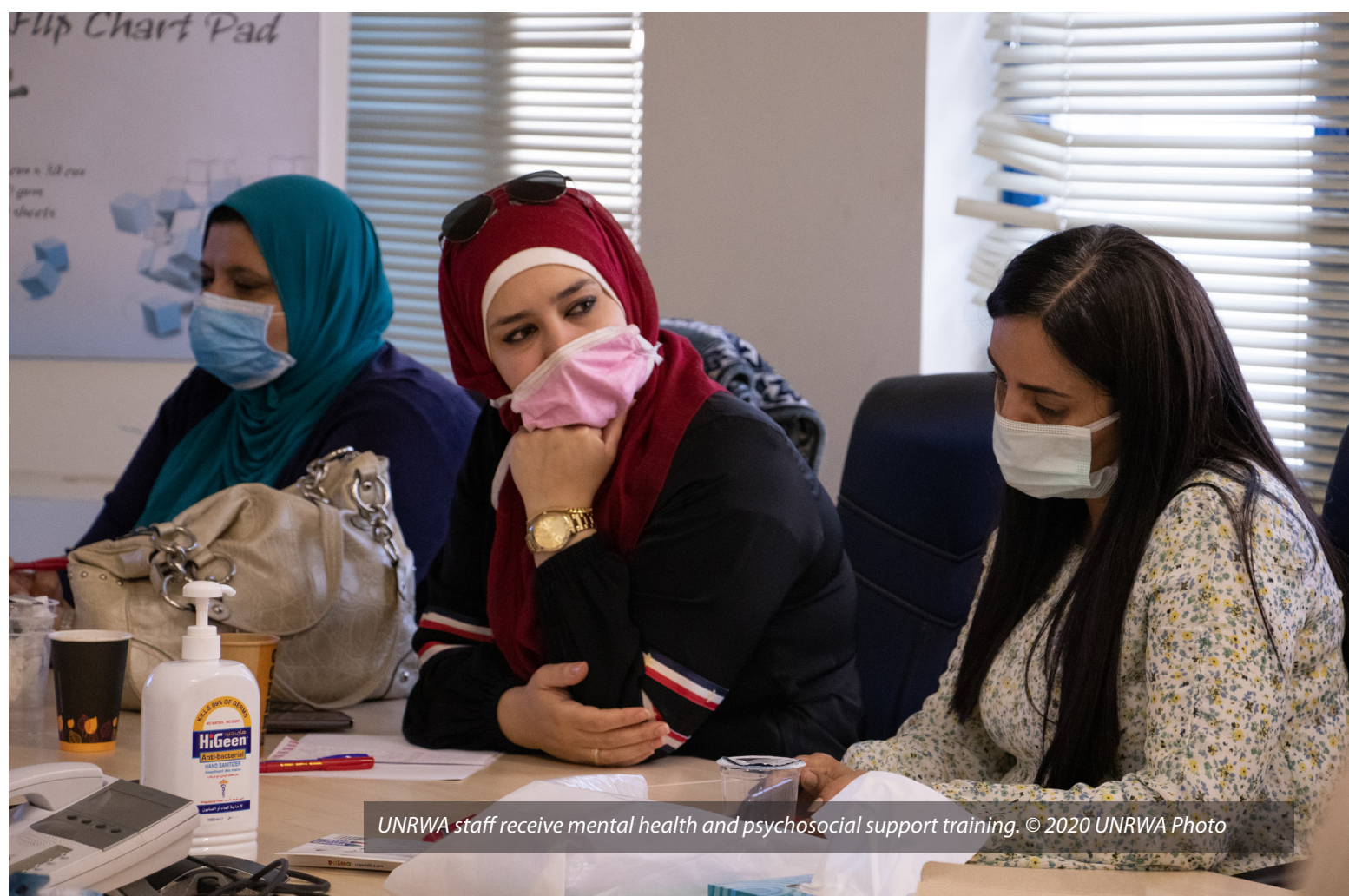
UNRWA staff receive mental health and psychosocial support training.

Between March and July, Palestine refugees in Jordan also received PSS counselling both in person and remotely, as needed. Targeted PSS counselling was provided by social workers and field GBV focal points to 70 Palestine refugees (37 women, 30 girls, two boys, one man and three persons with disabilities). Further, the health programme provided in-person MHPSS support to 86 patients at UNRWA HCs (up to mid-March, when HCs were still open, and from mid-June to the end of July, once they re-opened). Remote PSS support was also provided to 1,203 patients between April and June. Moreover, during the closure of schools, 3,682 Palestine refugee children (1,389 boys, 2,293 girls), including 631 PRS students, attended counselling sessions remotely. During the reporting period, 60 social workers also provided routine follow up calls to 205 families (approximately 984 individuals per social worker) to assess the overall needs and wellbeing of Palestine refugees.