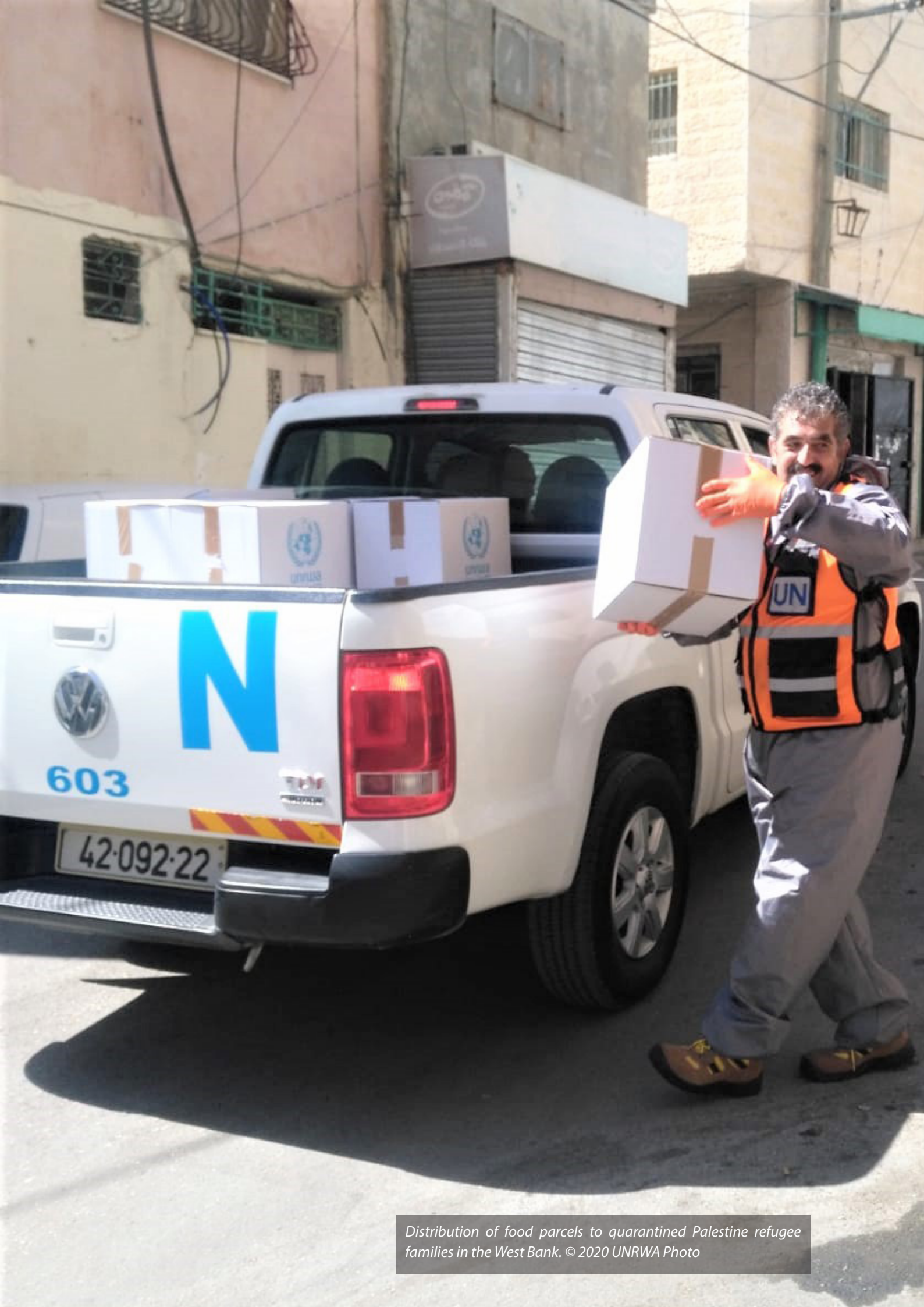
Distribution of food parcels to quarantined Palestine refugee families in the West Bank.