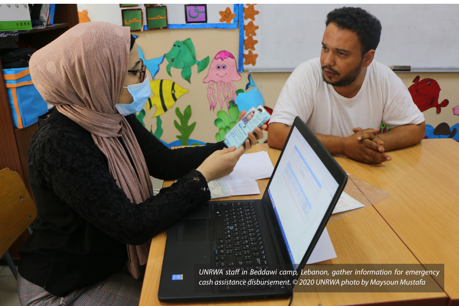
UNRWA staff in Beddawi camp, Lebanon, gather information for emergency cash assistance disbursement.

2019. Disbursement of assistance started on 18 May and was on-going at the time of writing. A total of 89,003 families (334,106 persons) had received their cash assistance as of 31 July 2020. The number of assisted PRL exceeded the target by 78,114 persons. As the UNRWA registration system does not offer accurate information of in-country populations, due to its voluntary nature, it appeared that the number of Palestine refugees claiming cash assistance was larger than anticipated as a result of the discrepancy between the number of actively service-seeking persons and those on the registration system. UNRWA is now exploring the introduction of a biometric verification process to verify and authenticate all in-country populations for future interventions.