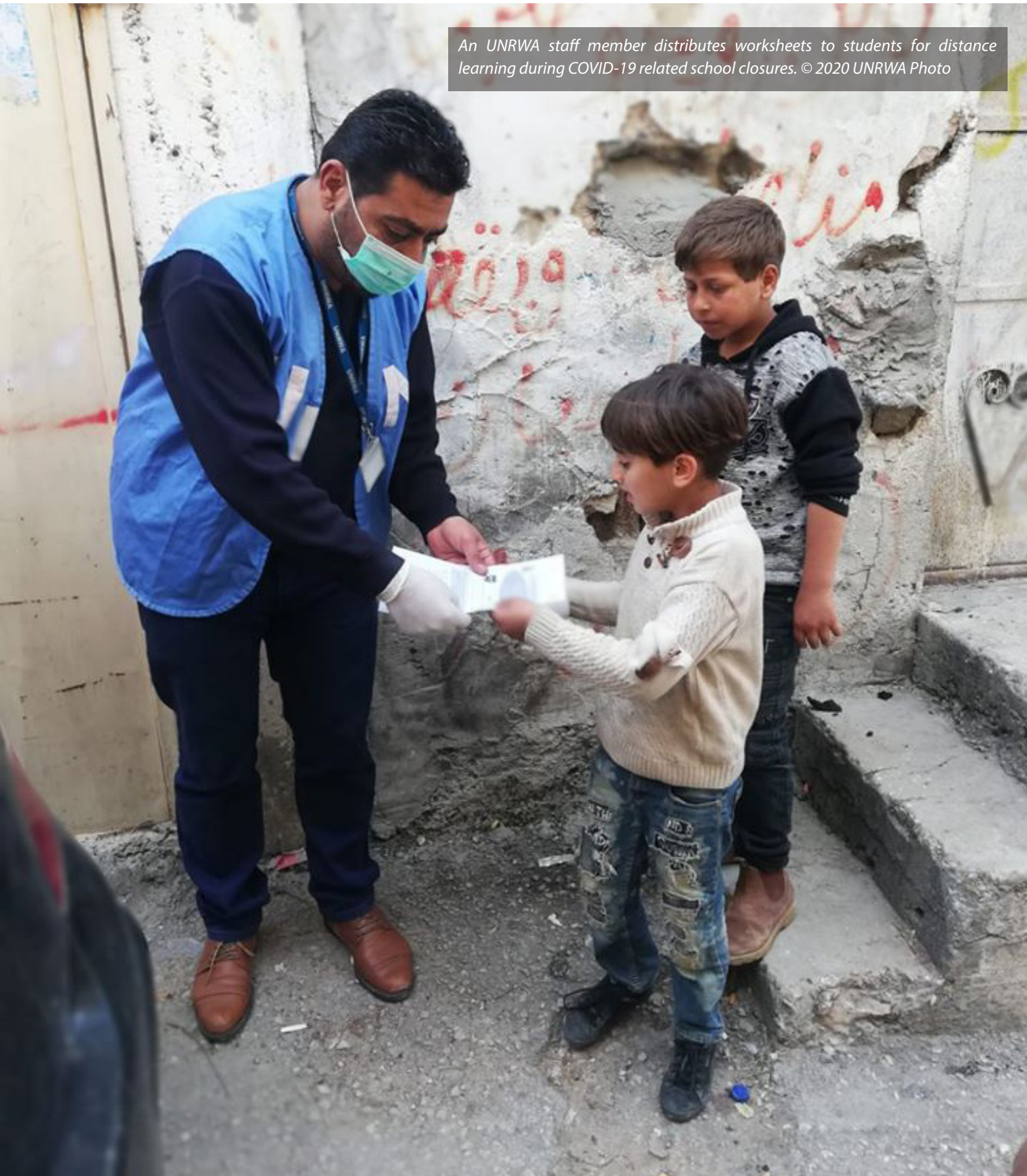
An UNRWA staff member distributes worksheets to students for distance learning during COVID-19 related school closures.

conducted 681 assessment interviews, whereby all those who were interviewed were provided with PFA and then linked to other essential services according to their need.