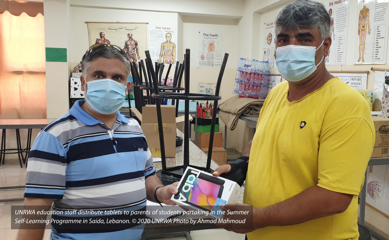
UNRWA education staff distribute tablets to parents of students partaking in the Summer Self-Learning Programme in Saida, Lebanon.