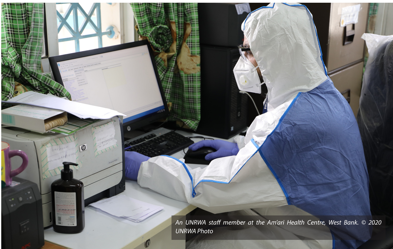
An UNRWA staff member at the Am'ari Health Centre, West Bank.

During the reporting period, the Relief and Social Services Programme (RSSP) was able to distribute hygiene kits to 5,250 refugee families affected by COVID-19. These kits contained several essential items including soap and individual hygiene items, PPE and cleaning supplies to cover a period of two weeks, which is the standard quarantine period as per WHO recommendations. Hygiene kits were distributed to refugee households under home quarantine or with one or more individuals self-isolating at home.