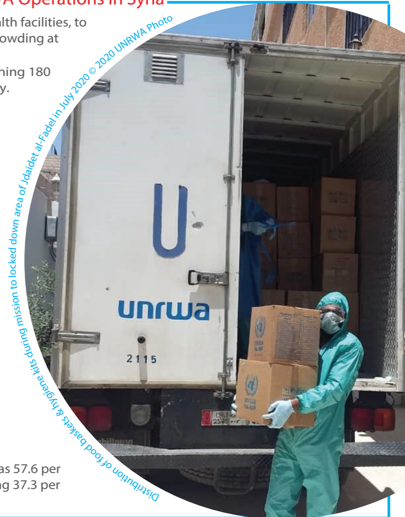
Distribution of food baskets & hygiene kits during mission to locked down area of Jdeidet al-Fadel in July 2020

Two hundred and seventy four trainees received training on the employability skills in July. As of 31 June, the US$ 93.4 million updated COVID-19 flash Appeal was 57.6 per cent funded (including confirmed pledges), with the Syria portion being 37.3 per cent funded (including confirmed pledges).