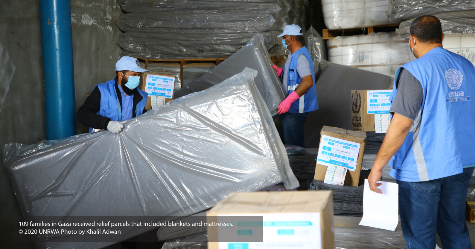
109 families in Gaza received relief parcels that included blankets and mattresses.