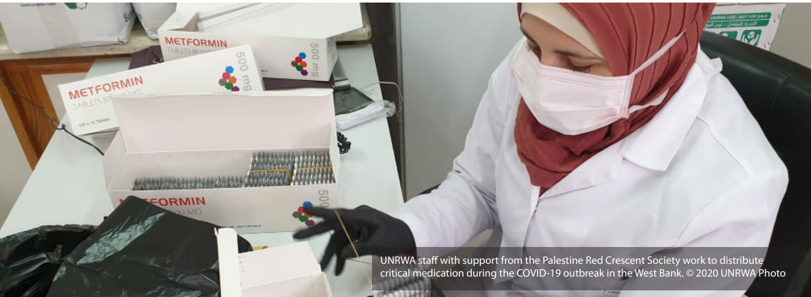
UNRWA staff with support from the Palestine Red Crescent Society work to distribute critical medication during the COVID-19 outbreak in the West Bank.