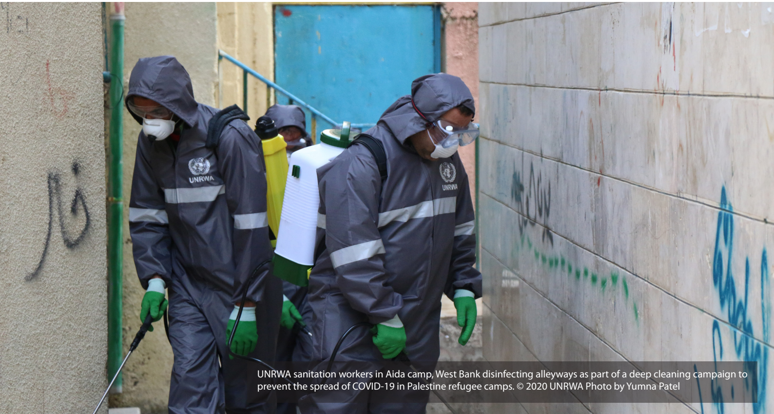
UNRWA sanitation workers in Aida camp, West Bank disinfecting alleyways as part of a deep cleaning campaign to prevent the spread of COVID-19 in Palestine refugee camps.