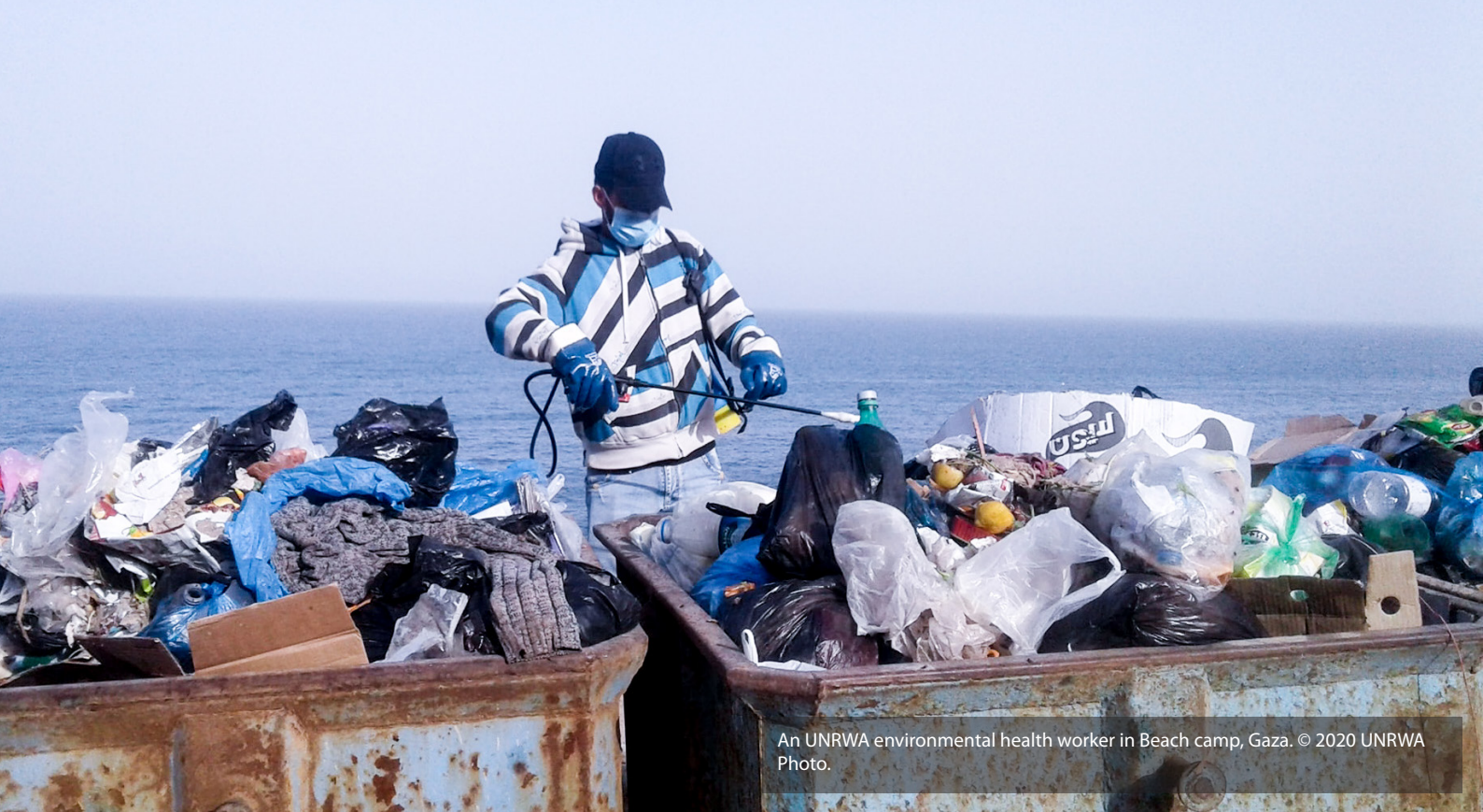
An UNRWA environmental health worker in Beach camp, Gaza.