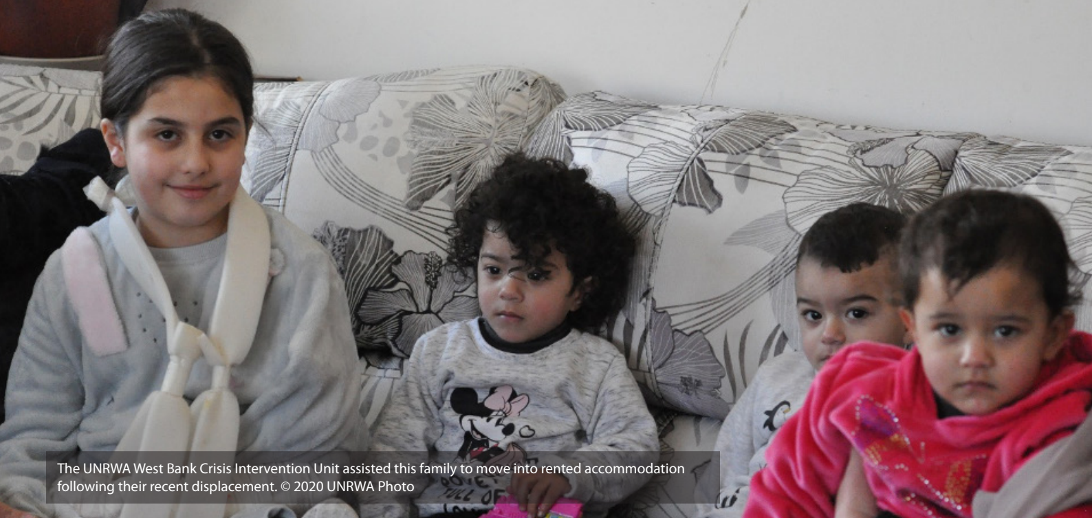
The UNRWA West Bank Crisis Intervention Unit assisted this family to move into rented accommodation following their recent displacement.