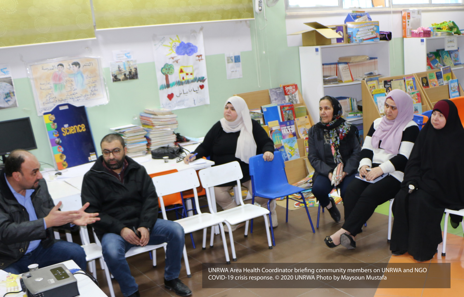
UNRWA Area Health Coordinator briefing community members on UNRWA and NGO COVID-19 crisis response.