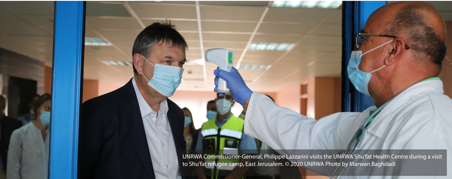
UNRWA Commissioner-General, Philippe Lazzarini visits the UNRWA Shu'fat Health Centre during a visit to Shu'fat refugee camp, East Jerusalem.