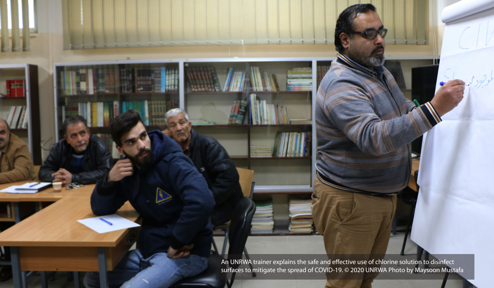
An UNRWA trainer explains the safe and effective use of chlorine solution to disinfect surfaces to mitigate the spread of COVID-19.