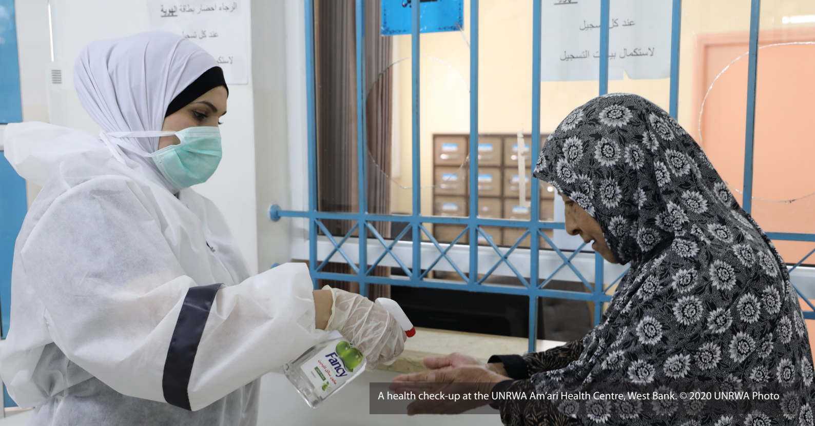
A health check-up at the UNRWA Am'ari Health Centre, West Bank.