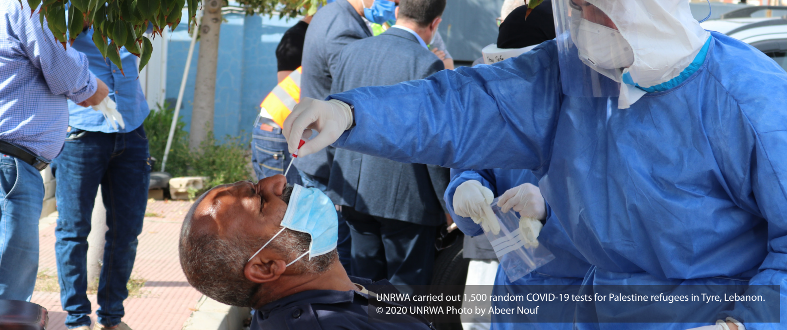
UNRWA carried out 1,500 random COVID-19 tests for Palestine refugees in Tyre, Lebanon.