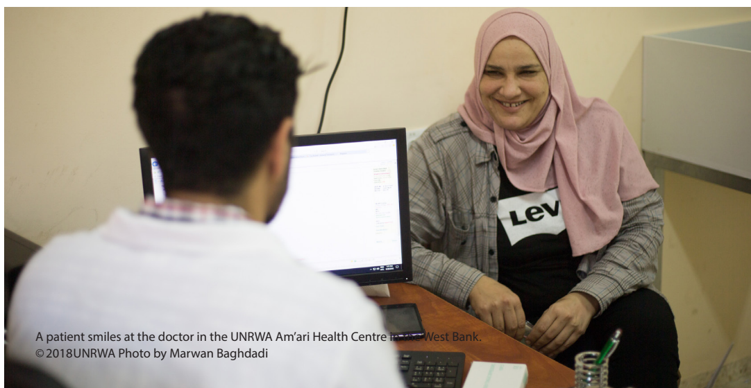
A patient smiles at the doctor in the UNRWA Am'ari Health Centre in the West Bank.

UNRWA also partners with a number of other UN agencies, including UNFPA, UNICEF, ILO, OHCHR and UNHCR, to support Palestine refugee access to quality services, as well as the Red Cross / Red Crescent movement and local and international NGOs, including the Norwegian Refugee Council, Humanity and Inclusion and Save the Children, amongst others.