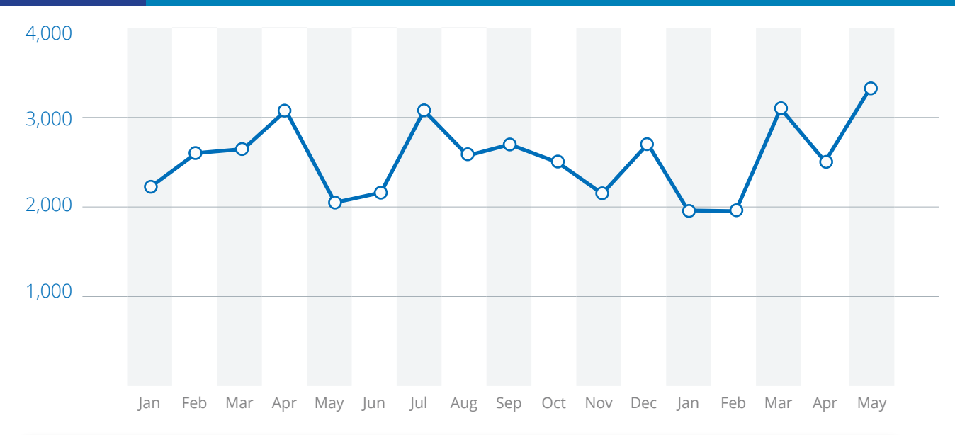
Chart 1: Total number of referrals approved for Gaza patients, January 2018 - May 2019

referrals approved for financial coverage for healthcare outside the Palestinian Ministry of Health