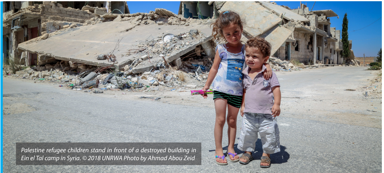
Palestine refugee children stand in front of a destroyed building in Ein el Tal camp in Syria.