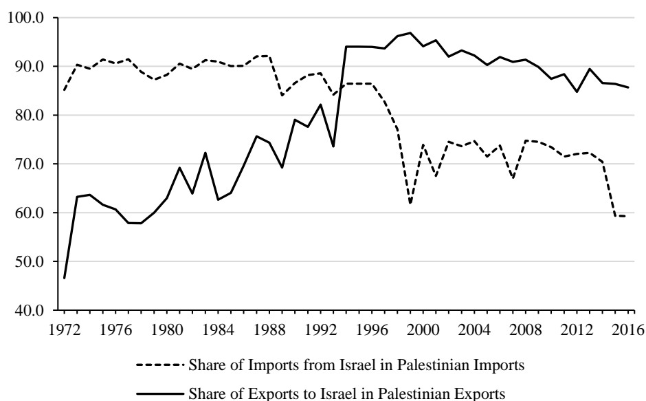
Figure 2 Share of Israel in Palestinian international trade (Percentage)

17. The restrictions on Palestinian trade establish substantial non-tariff barriers and divert Palestinian trade from competitive world markets to the less favourable Israeli markets at significant cost to Palestinian producers and consumers. Imports of the Occupied Palestinian Territory from Israel are dominated by goods for which Israel does not have a particular comparative advantage in exporting; this means they can be procured at lesser cost from other markets. Even when trading with third countries, Palestinian traders are often forced to access foreign markets through Israeli intermediaries, an arrangement that drains away Palestinian economic resources. The degree of trade diversion is reflected in that, between 1972 and 2017, Israel absorbed 79 per cent of total Palestinian exports and 81 per cent of imports. Trade concentration with Israel, as depicted in figure 2, mirrors the isolation of the Occupied Palestinian Territory from global markets.