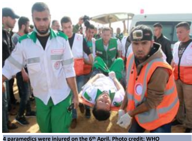
4 paramedics were injured on the 6 th April.