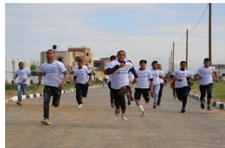
Marathon Activity, "let's gather flowers" community initiative in Al- Zanna Family Center, Khanyounis, Gaza Strip. UNICEF 2018

As of March 2018, the education projects funding for 2018 HRP has not been disbursed to the education Cluster (Source: OCHA FTS).