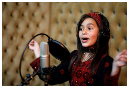
A girl recording the song in a studio in Gaza City.

As part of the emergency preparedness and response, UNICEF continued to follow up with the Israeli authorities on pending customs approvals, which include supplies for the prepositioning of emergency Health and Nutrition medical drugs and equipment. These have now nearly all been approved and the first shipment have started and are scheduled to arrive this quarter. UNICEF SoP received and dispatched to the MOH 74,226 kg of various drugs of which 51,000 doses of vaccines, for a total value of US$410,000 to serve 25,500 children.