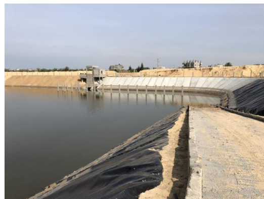
Rafah storm water detention basin has collected storm water and prevented flooding for 20,000 people. UNICEF 2018

UNICEF leveraged the presence and strength of its long-standing partners to reach more people with WASH interventions. In this regard, in partnership with Action Against Hunger (ACF), UNICEF reached 2,120 households, including 1,060 children, with water storage tanks in Gaza to increase the household storage capacity when water supply is low. In the West Bank, 7,904 persons, including 3,952 children, have improved and increased access to drinking water at a subsidized price through a voucher system distributing trucked water through an equitable costing mechanism.