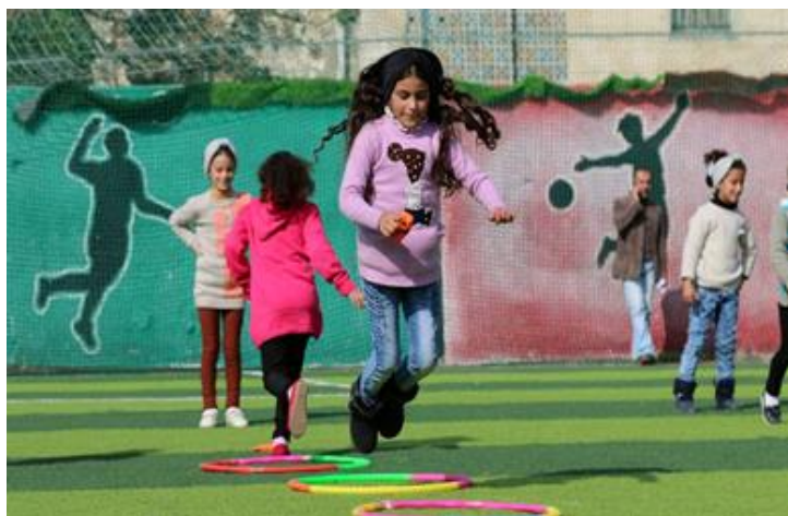
Sport activity, Forsan Al-Ghad Family Center, Gaza Strip