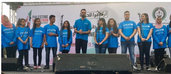
Shaheen and the adolescents performing the song in Bethlehem.

On 23 March, UNICEF participated in the Palestine Marathon in Bethlehem to promote healthy lifestyles and child rights. A new song was written with two famous Lebanese composers for 2017 Arab Idol Winner Yacoub Shaheen, a Bethlehem native who had already participated in a number of UNICEF initiatives in support of Palestinian children. UNICEF selected 19 children living in vulnerable communities across the State of Palestine who contributed to the lyrics and recorded a song, “Dreams alone are not enough”. Shaheen and 13 of the children performed the song in front of the crowd minutes before the marathon started, after which they joined UNICEF staff in the race. The six children living in Gaza were not able to attend the event as they were not given permits to go through Erez Crossing. Stories and posts were shared on social media posts and a video clip of the event will soon be released.