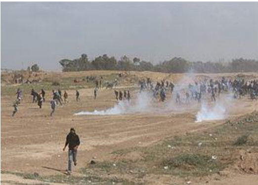
Clashes near the Gaza perimeter fence, east of Al Bureij camp, 30 March 2018.

Every Friday since March 30, over 40,000 Palestinians in Gaza have participated in demonstrations along the fence with Israel to protest the ten-year-old blockade and support the “right of return” for Palestinian refugees. While the protests were overall peaceful and most demonstrators did not approach the fence, 33 Palestinians have been killed, including three children (source: UN). According to the Gaza Ministry of Health, more than 2,835 Palestinian have been injured, of which 277 are children. This is the highest number of casualties since the 2014 hostilities. In the West Bank, tensions have been running high since December, with clashes sporadically erupting in various parts of the territory. UNICEF has appealed to all actors to put the protection of children first.