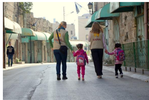
Protective Presence volunteers working for EAPPI walking children to school in Hebron.