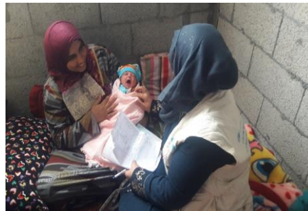
Postnatal home visit in Rafah.

UNICEF has completed the first phase of the rehabilitation of the neonatal unit in Beit Jala hospital in West Bank to double the existing capacity of the neonate unit (NICU) anticipated to benefit more than 1,000 neonates yearly. In Gaza, 1,453 vulnerable newborns benefited from quality early newborn life-saving services and effective interventions at the newly constructed NICU units in Rafah and Khan Younis.