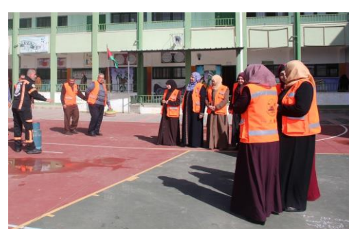
Fire safety training for teachers in Rafah as part of emergency preparedness activities in Gaza. GUCC 2018.