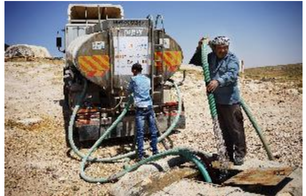
Water distribution to respond to acute water scarcity needs in Area C in Hebron.

WASH activities encountered several challenges, especially delays in the entry of materials for repair work and rehabilitation of water networks into Gaza. Other challenges included the shrinking of resources, capacity building needs for WASH stakeholders, and the destruction and uprooting of water networks that were installed in Area C. According to the Humanitarian Needs Overview HNO for 2017 which informs WASH HRP 2018, approximately 1.8 million persons are in need for humanitarian WASH assistance, out of which 52 per cent are children. The WASH Cluster coordinated the supply of emergency fuel to more than 130 critical WASH installations in Gaza and developed an analysis of winterization preparedness and response where over half a million of persons are at the risk of being exposed to floods.