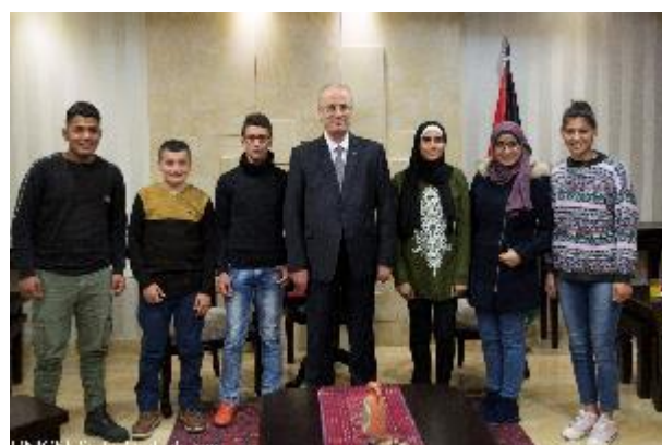
Palestinian students meet with Prime Minister Rami Hamdallah on World Children's Day

Public and private advocacy was undertaken to help increase children's safe access to school in the West Bank, and also to increase the protection of children and ensure they stay in school even during heightened tensions across the State of Palestine in December.