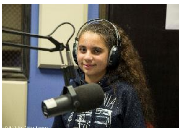
A Palestinian adolescent "taking over" Nisaa FM radio for World Children's Day