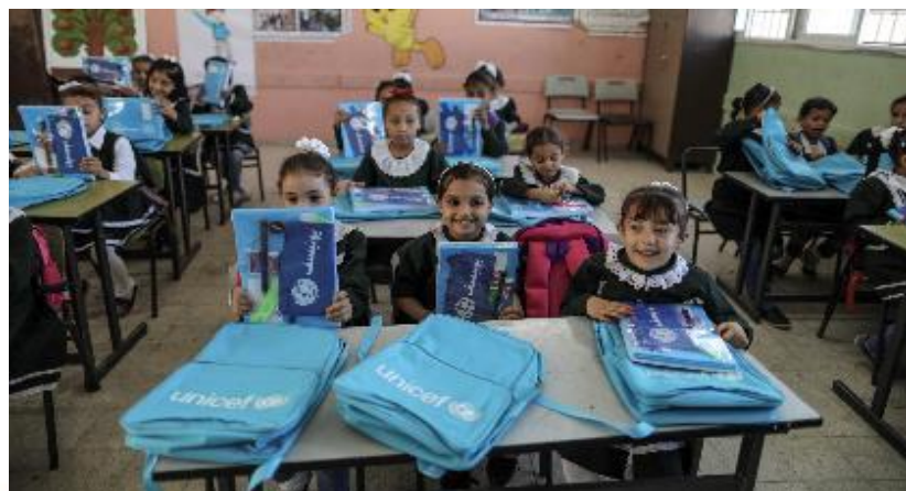
Vulnerable children in Gaza receiving UNICEF schoolbags and essential stationary.