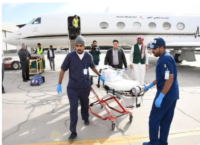
Evacuation of conjoined twins, Queen Alya Airport in

In 2017, UNICEF continued to support the NGO Neo East Council of Churches to deliver outreach health care interventions for the most vulnerable and high risk pregnancies and babies. A total of 5,411 (100 per cent of the annual target) mother and new-born babies at high risk have benefited from targeted postnatal home visit services within 24-hours after delivery. In total, 56,473 vulnerable children and their mothers benefitted from home based and community counselling on early child health, nutrition and development including early detection of children with disabilities and intervention.