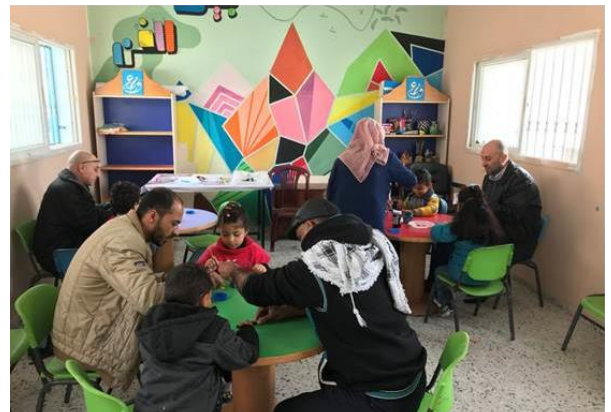
Child-Parent interaction activities inside Kindergarten, Al Maghazi camp, Gaza