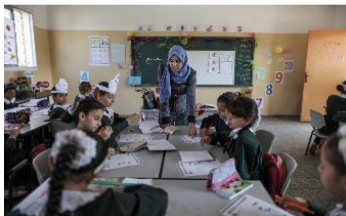
Remedial catch-up classes for children at risk of falling behind in school, Gaza.

In Gaza, 3,296 vulnerable children, grades 4 to 6, who were experiencing difficulties in learning, managed to improve their skills in numeracy and literacy through UNICEF-supported remedial education classes. The programme focuses on Arabic and mathematics to enable students to achieve their potential, particularly those failing to meet minimal normative standards in these subjects.