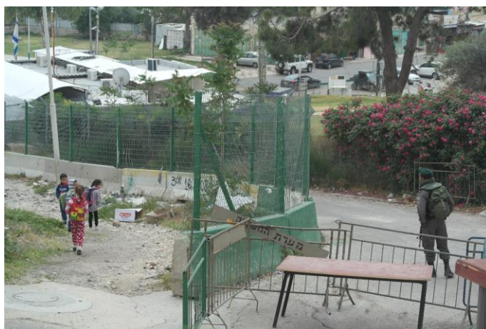
New movement barrier affecting school children in Hebron.

In September, UNICEF brought together 27 Gazan and Japanese adolescents to discuss their perceptions, concerns and responsibilities on prevailing problems related to the environment, education, electricity, crises and poverty. Movement and access restrictions affecting Gaza compelled the event to be conducted through a virtual meeting.