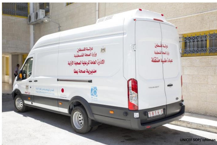
New mobile clinic handed over to the Ministry of Health to service vulnerable families in Area C.

UNICEF, with the Government of Japan, officially handed over to the Ministry of Health two mobile clinics that are serving the most vulnerable Bedouin and herding communities of Dura and Yatta. Each clinic consists of a team of health professionals and provides health services to 5,000 extremely vulnerable families. To date 96 children 190 adults benefited from the essential package of services.