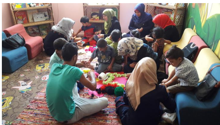
Child-parent inter-action activity, Family Centre in Beit Hanoun, North Gaza

During this quarter, in Gaza, 1,536 children (650 girls and 886 boys) received individual case management support, and a total cumulative of 4,610 caregivers benefitted from awareness raising sessions on the protection of their children. In addition, 8,220 children and caregivers (4,999 females and 3,221 males) benefitted from Explosive Remnants of War (ERW) risk education sessions through family centers. As a result of the work of the working group partners, a total of 62,637 children and caregivers received ERW messages.