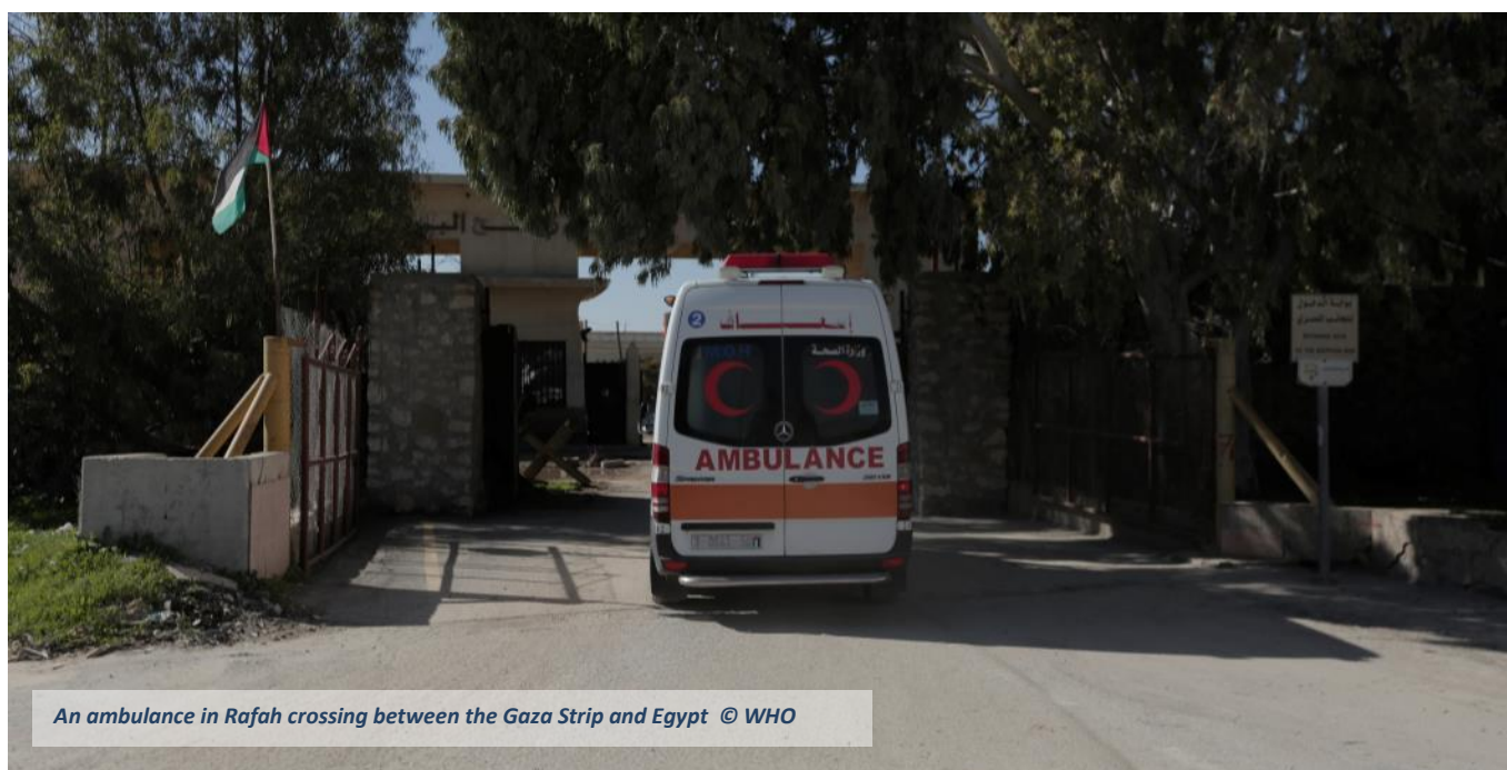
An ambulance in Rafah crossing between the Gaza Strip and Egypt

No medical aid or medical delegates entered Gaza via Rafah during August. Since the beginning of 2017, the terminal was open for only 16 days during the year allowing 1,222 patients to exit for medical treatment. Before the July 2013 closure, more than 4,000 Gaza residents crossed Rafah terminal to Egypt each month for health-related reasons.