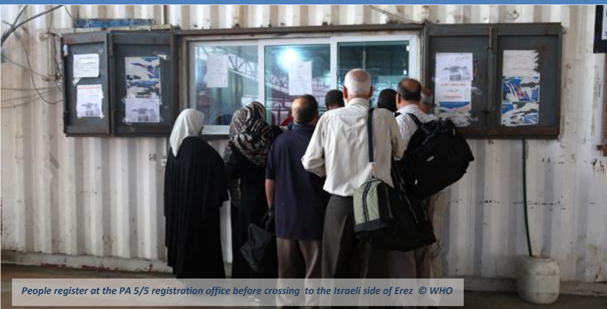
People register at the PA 5/5 registration office before crossing to the Israeli side of Erez