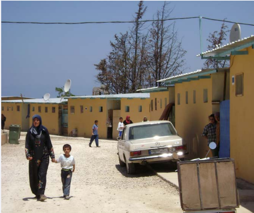
Temporary shelter plot 774