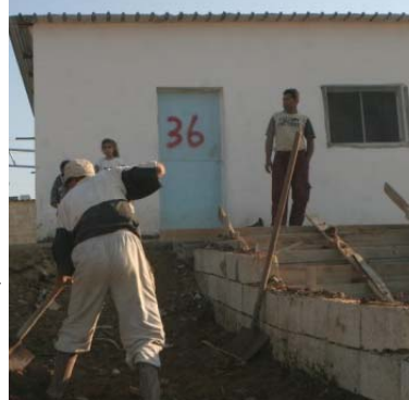
Temporary shelter plot 23

was growing pressure on UNRWA from the government to relocate these families as the schools had to be vacated for the returning students. UNRWA appealed to the families to leave the schools and assured them that they would receive rental subsidies to help cover the cost of renting private accommodation. Some families did move into rented premises, however the majority, fearful that this move would end up being a permanent solution, opted to remain in the UNRWA schools or with host families to wait for temporary shelters to be built near their destroyed camp. By December 2007, all the UNRWA schools in Beddawi camp were vacated when the refugees were able to move into two newly-built temporary shelter sites and 11 collective centres.