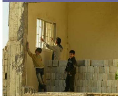
NBC Adjacent Areas