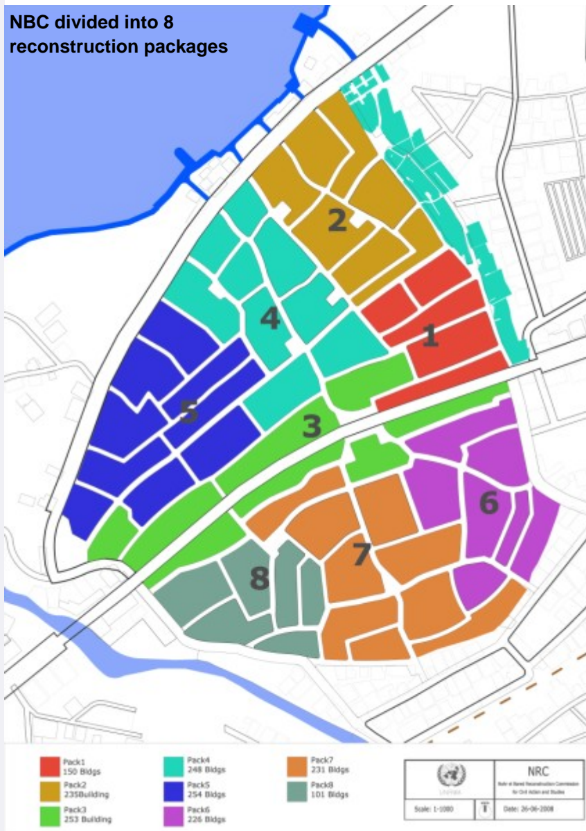
NBC divided into 8 reconstruction packages