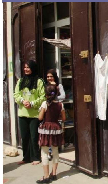
The garages, Beddawi

The Agency's ability to respond to the housing needs of the displaced refugees was an enormous challenge throughout the Emergency Appeal period as most contributions were earmarked for specific