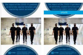
The Impact of the COVID-19 Pandemic on Counter-Terrorism and Countering Violent Extremism, June 2020 and December 2020 Update