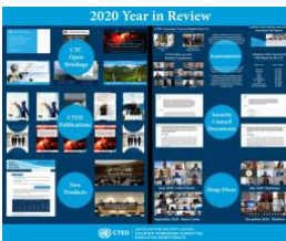
2020 Year in Review