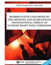
Trends Alerts and Trackers