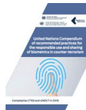
Compendium on the Responsible Use and Sharing of Biometrics