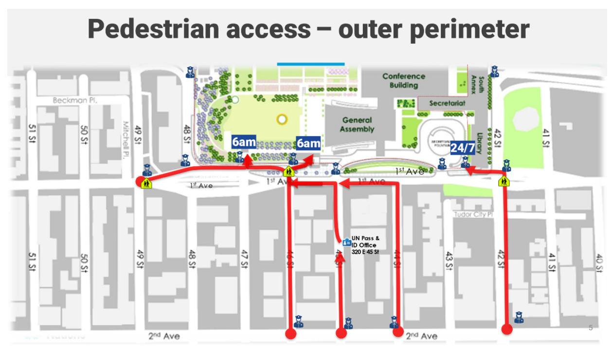
Figure 1: Pedestrian access - outer perimeter

For information on the access and participation of delegations, civil society, and media, please refer to the <u>UNGA 78 Information Note</u> available online.