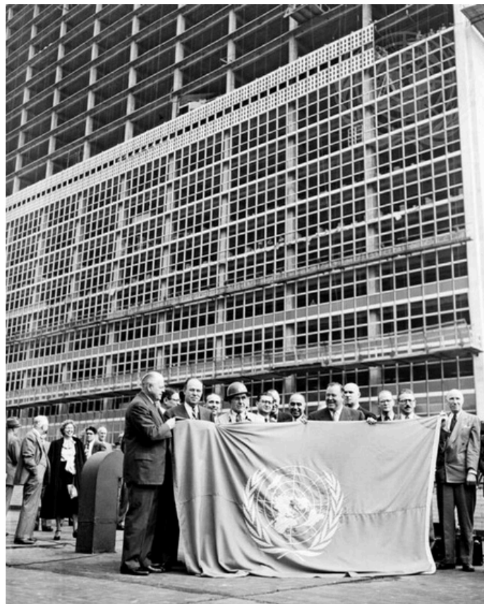
United Nations Permanent Headquarters - Completed Steel Work