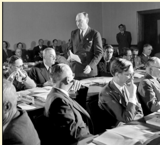
Harold E. Stassen Addressing a Meeting at The San Francisco Conference