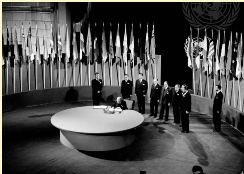
The San Francisco Conference, 25 April - 26 June 1945: Peru Signs the United Nations Charter