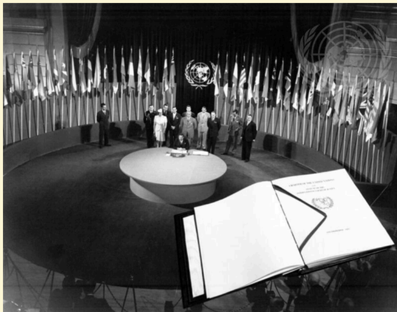
The San Francisco Conference, 25 April-26 June 1945