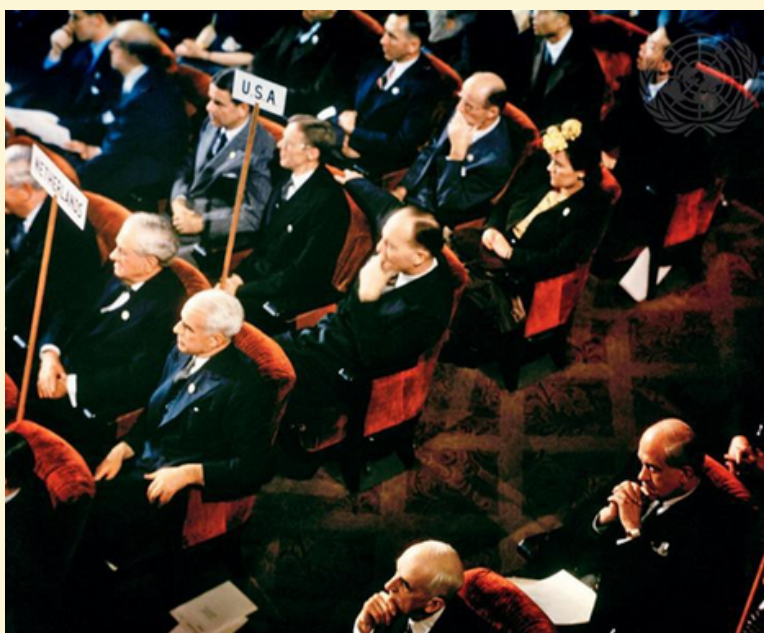
The San Francisco Conference: A View of the US Delegation, Including its Chairman, Edward R. Stettinius, Jr.