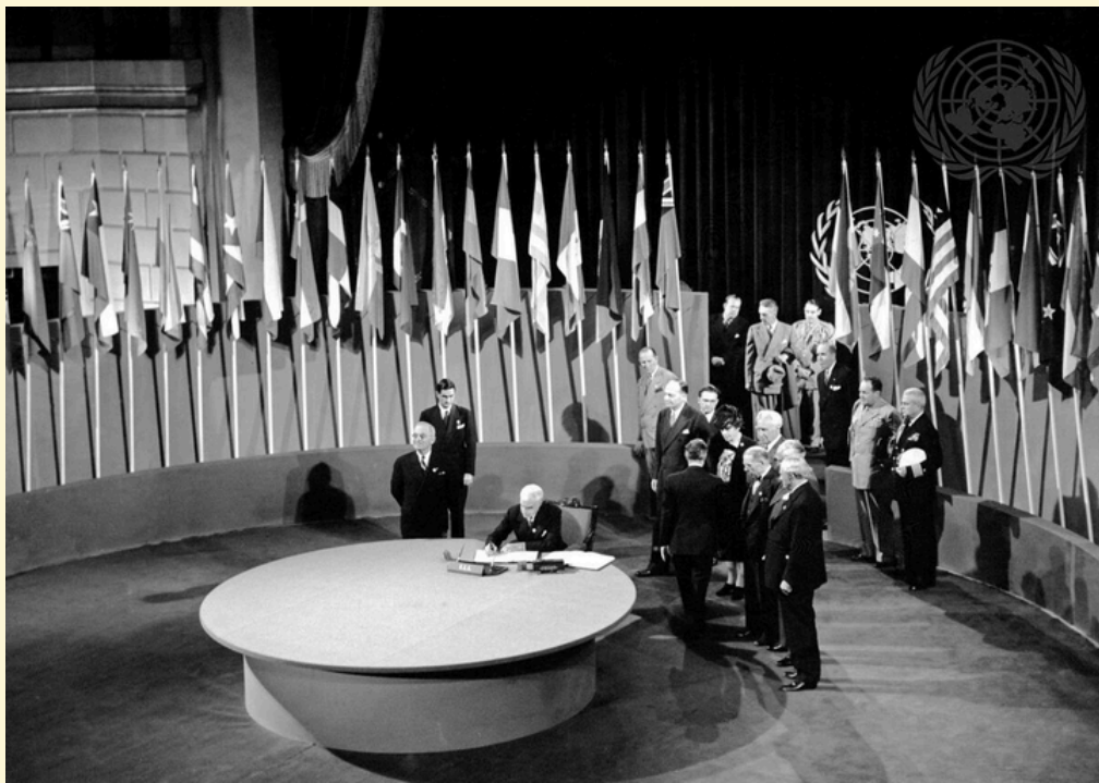
The San Francisco Conference, 25 April - 26 June 1945: The United States Signs The United Nations Charter