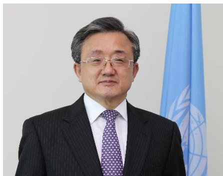
Mr. Liu Zhenmin

United Nations Secretary-General António Guterres appointed Liu Zhenmin of China as the Under-Secretary-General for Economic and Social Affairs in 2017. Prior to his appointment, Mr. Liu had been Vice-Minister for Foreign Affairs of China since 2013. Among his various diplomatic assignments, he served as Ambassador and Permanent Representative, Permanent Mission of the People's