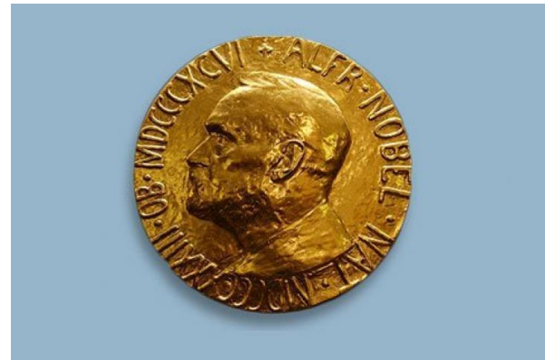
United Nations Peacekeeping Forces received the Nobel Peace Prize 1988

In 1988, the Nobel Committee awarded the Peace Prize to the United Nations Peacekeeping Forces because “The peacekeeping forces of the United Nations have, under extremely difficult conditions, contributed to reducing tensions where an armistice has been negotiated but a peace treaty has yet to be established.”