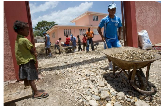
United Nations Stabilization Mission in Haiti (MINUSTAH) assist in the renovation of a local school 2008

The nature of conflicts also changed over the years. UN Peacekeeping was originally developed to deal with interstate conflict but was increasingly applied to intrastate conflicts and civil wars.