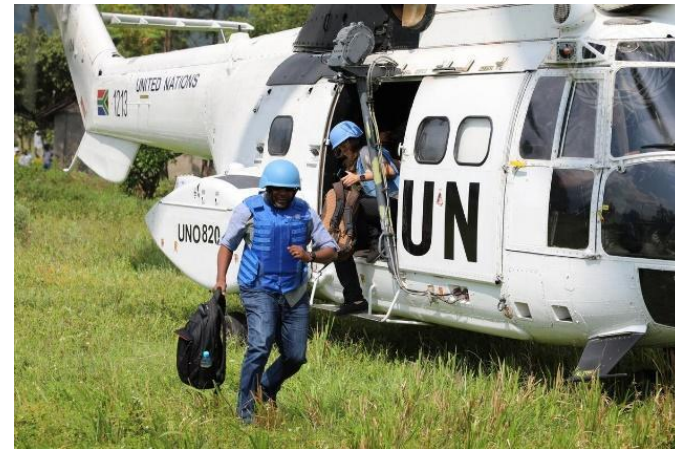
United Nations Organization Stabilization Mission in the Democratic Republic of the Congo (MONUSCO) 2021