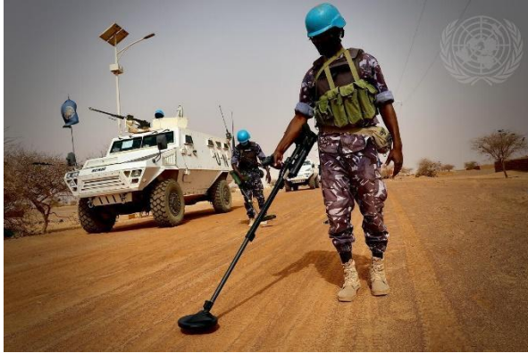
United Nations Stabilization Mission in Mali (MINUSMA) surveys a road (demining) in the northeast of Mali 2021

UN peacekeepers were now increasingly asked to undertake a wide variety of complex tasks, from helping to build sustainable institutions of governance to human rights monitoring, to security sector reform, to the disarmament, demobilization, and reintegration of former combatants.