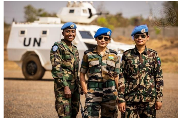
United Nations Mission in South Sudan (UNMISS) women peacekeepers 2021

Peacekeepers (also known as 'Blue Helmets') are women and men from various member states (countries), who help countries navigate the difficult transition from conflict to peace. Although they serve under the UN flag, peacekeepers are not UN soldiers. They represent their Member States and usually join as an integral unit from their home countries' armed forces or police.