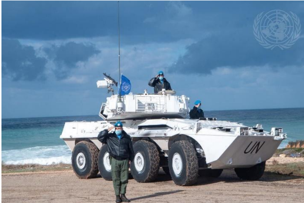
Military peacekeepers serving with the United Nations Interim Force in Lebanon (UNIFIL) 2021

Since 1948, more than 70 peacekeeping operations have been deployed by the UN. Over the years, hundreds of thousands of military personnel and tens of thousands of UN police and other civilians from more than 120 countries have participated in UN Peacekeeping operations.