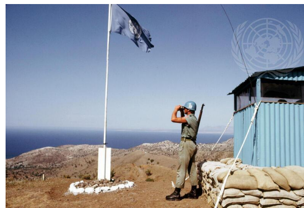
United Nations Peacekeeping Force in Cyprus (UNFICYP) in sentry duty (guarding duty) 1973

The Post-Cold War Surge: With the end of the Cold War, the strategic context for UN Peacekeeping changed dramatically. The UN shifted and expanded its field operations from “traditional” missions, involving generally observation tasks performed by military personnel, to complex “multidimensional” enterprises. These multidimensional missions were designed to ensure the implementation of comprehensive peace agreements and assist in laying the foundations for sustainable peace.