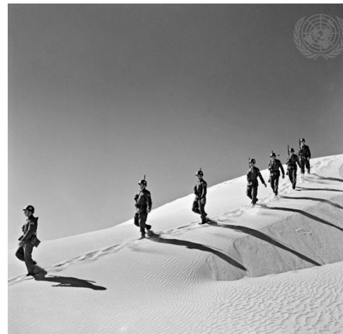
UN Emergency Force in the Sinai Peninsula, Yugoslav troops on patrol duty 1957

The Early Years: UN Peacekeeping was born at a time when Cold War rivalries frequently paralyzed the Security Council. Peacekeeping was primarily limited to maintaining ceasefires and stabilizing situations on the ground, providing crucial support for political efforts to resolve conflict by peaceful means. Those missions consisted of unarmed military observers and lightly armed troops with primarily monitoring, reporting, and confidence-building roles.