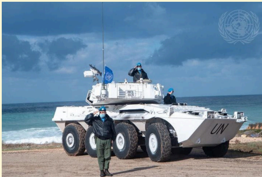
Military Peacekeepers Serving With the United Nations Interim Force in Lebanon (UNIFIL) 2021