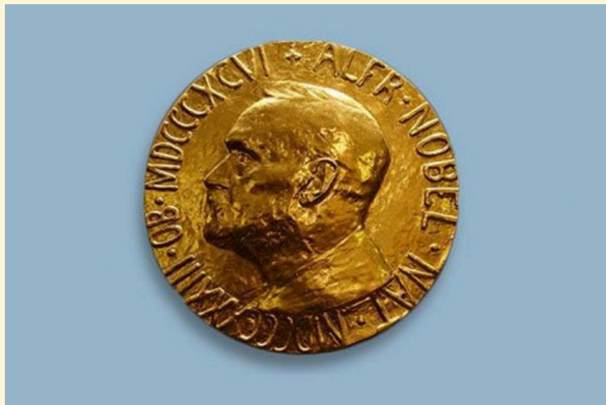
United Nations Peacekeeping Forces Received the Nobel Peace Prize 1988