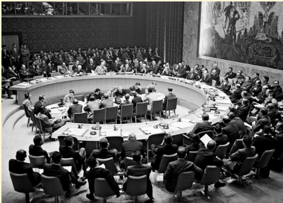
Security Council Meets on Membership Question in 1955