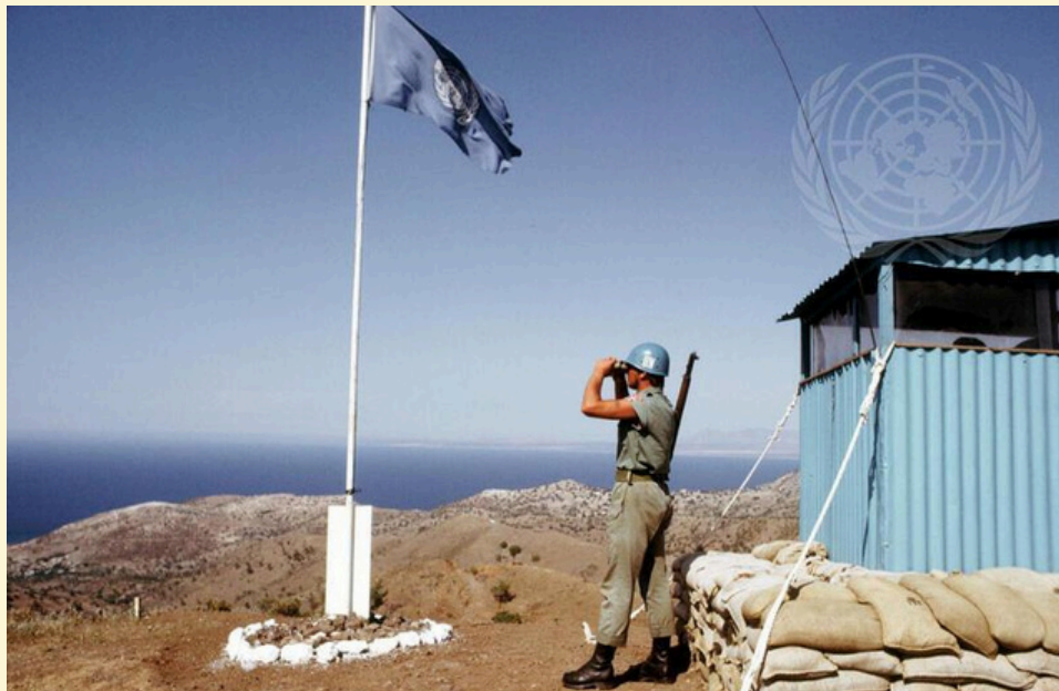
United Nations Peacekeeping Force in Cyprus (UNFICYP) in Sentry Duty (Guarding Duty) 1973