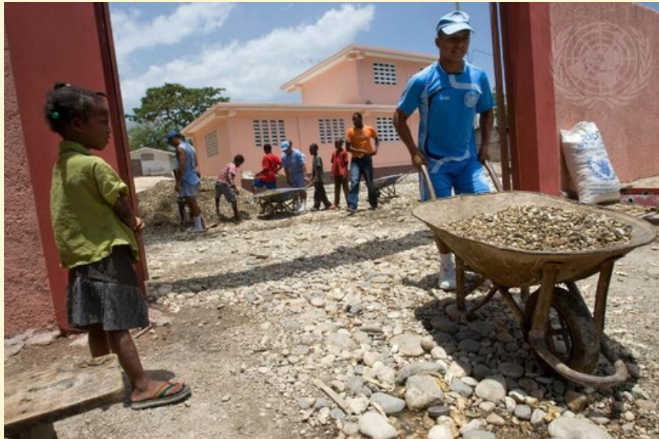
United Nations Stabilization Mission in Haiti (MINUSTAH) Assist in the Renovation of a Local School 2008