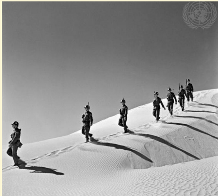
Emergency Force in the Sinai Peninsula, Yugoslav Troops on Patrol Duty 1957