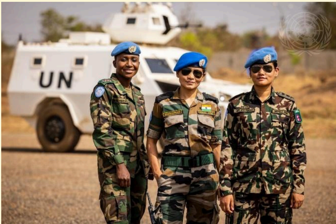
United Nations Mission in South Sudan (UNMISS) Women Peacekeepers 2021