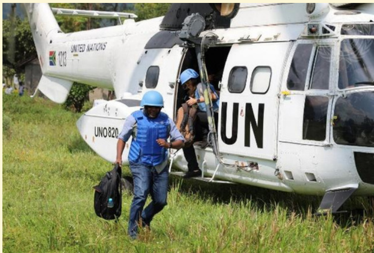
United Nations Organization Stabilization Mission in the Democratic Republic of the Congo (MONUSCO) 2021