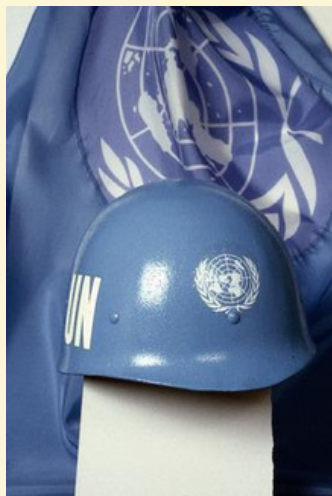
UN Blue Helmet ©UN Photo

Source: What is the origin of the blue helmets worn by UN Peacekeepers?