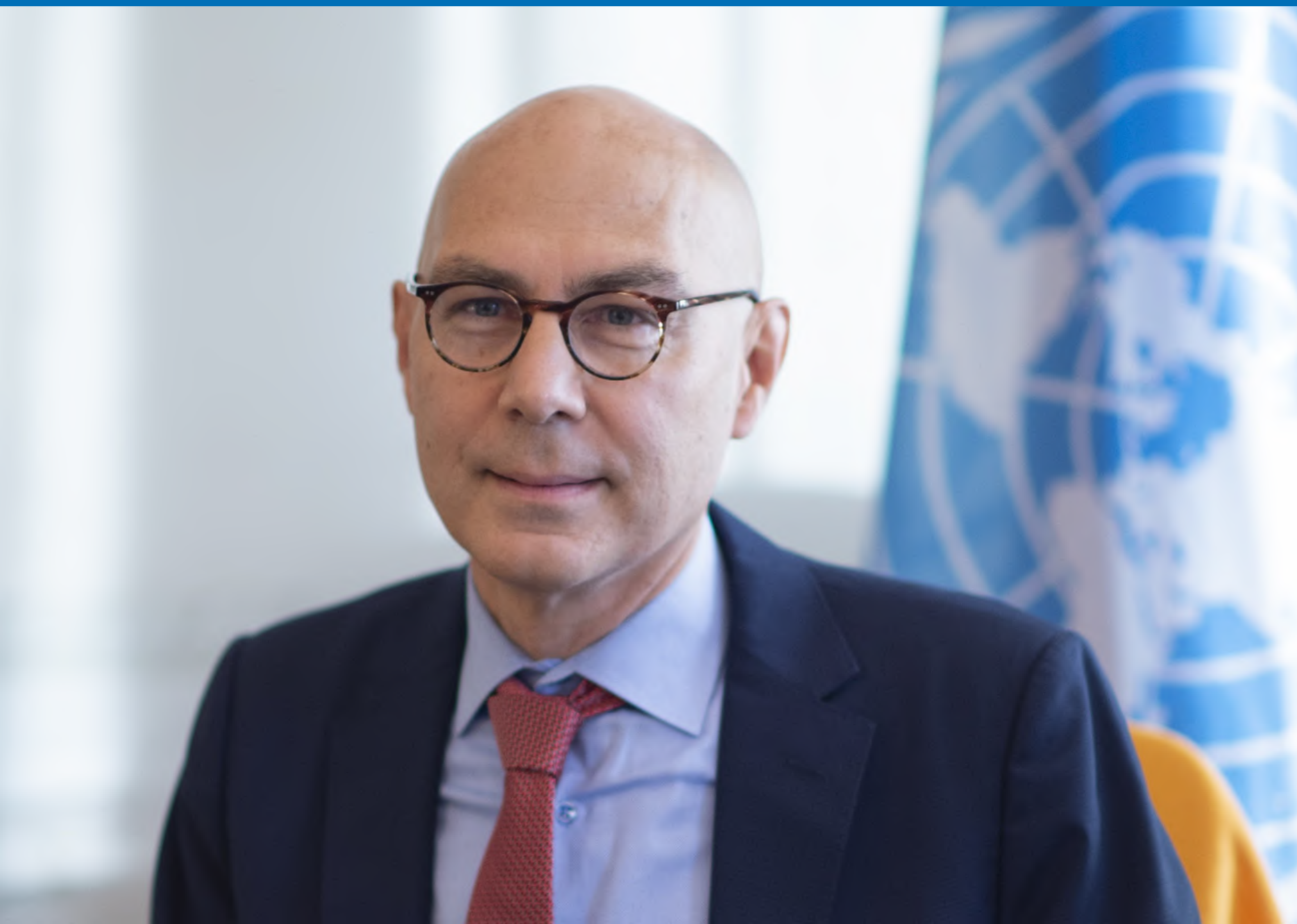
United Nations High Commissioner for Human Rights, Volker Türk

Despite conflicts that may divide us, it's in the pursuit of peace, justice, and equality that we discover our common ground. Together, we can envision a future where every individual's rights are safeguarded, conflicts are resolved through dialogue, and peace prevails. Now, more than ever, it's time for human rights. Join us this Human Rights Day and help ensure that every person can live in peace and dignity.