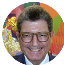
Mr. Joaquim Levy Brazil