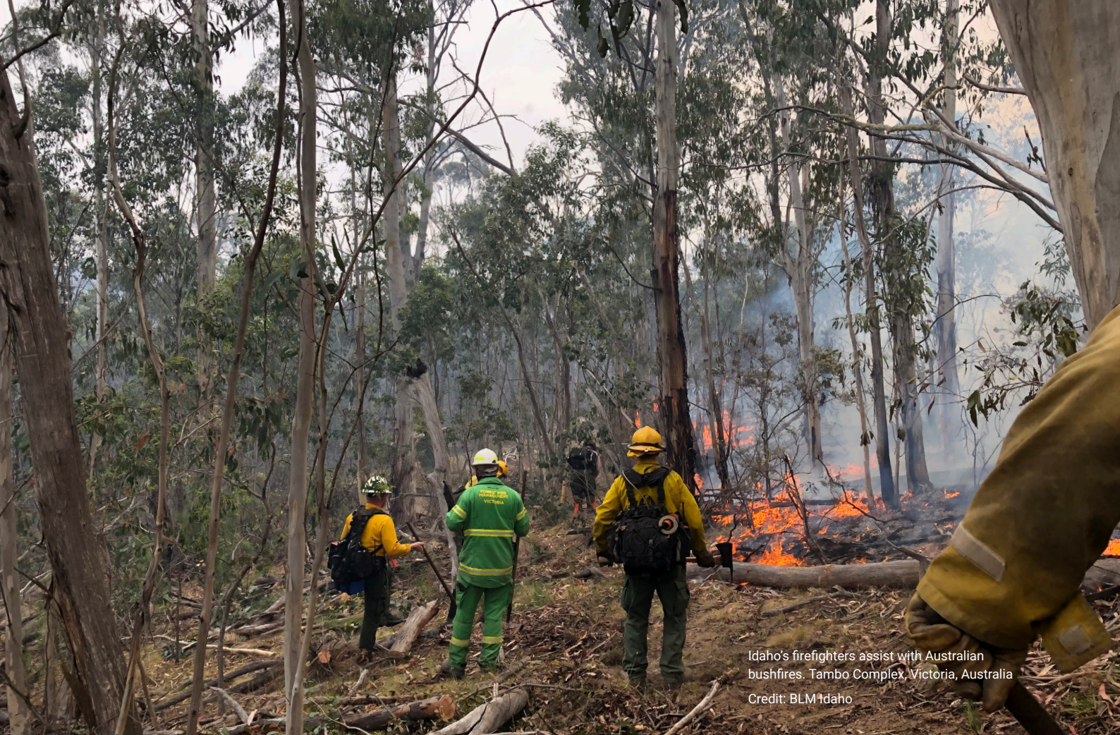
Idaho's firefighters assist with Australian bushfires. Tambo Complex, Victoria, Australia