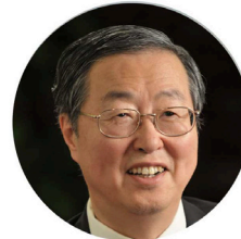
Dr. Zhou Xiaochuan China