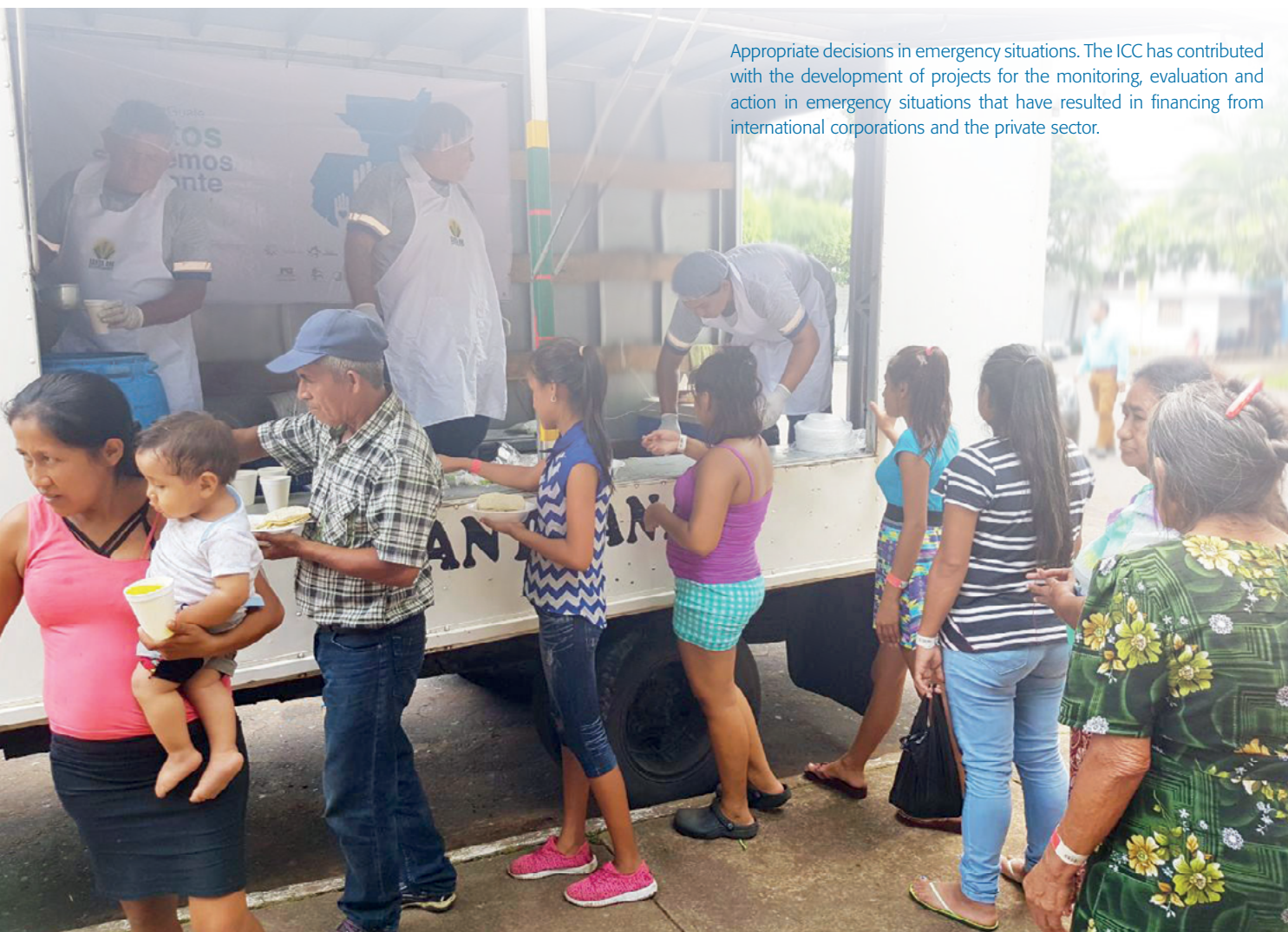
Appropriate decisions in emergency situations. The ICC has contributed with the development of projects for the monitoring, evaluation and action in emergency situations that have resulted in financing from international corporations and the private sector.

the private and public sectors for the management of emergencies. The process was part of a project funded by the European Commission. Due to the high frequency of disaster events in southern Guatemala, the plans have been put into operation three times from 2017 to 2020. All the sugar companies, Asazgua, and Fundazúcar deploy staff and resources to help authorities and communities during the emergencies.