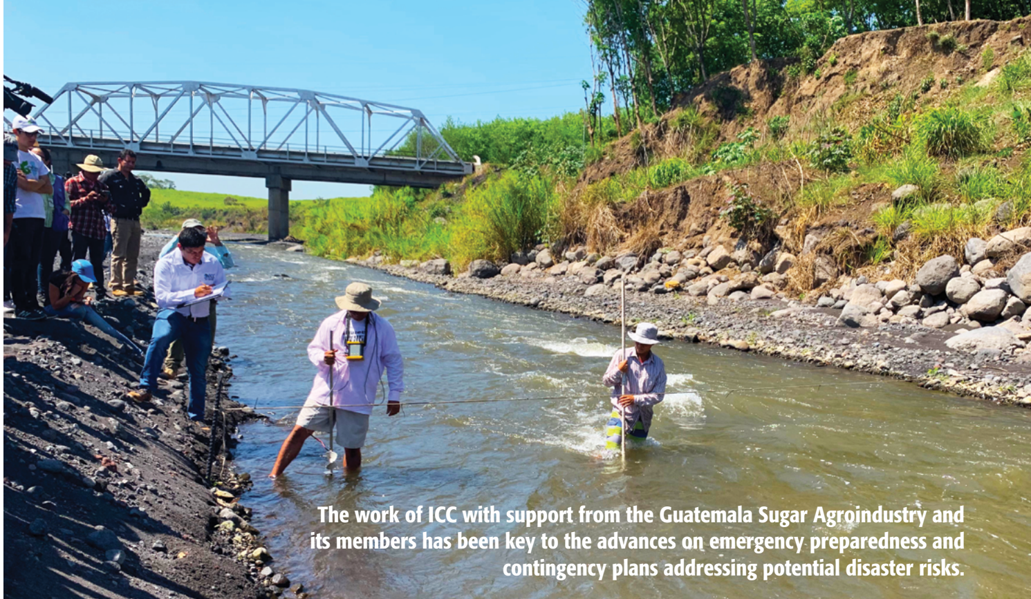
The work of ICC with support from the Guatemala Sugar Agroindustry and its members has been key to the advances on emergency preparedness and contingency plans addressing potential disaster risks.