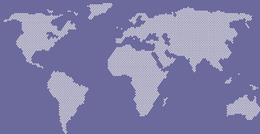
Countries in the LDC category after the 2021 triennial review

Latin America and the Caribbean 1 Africa 33 Asia 9 Oceania 3